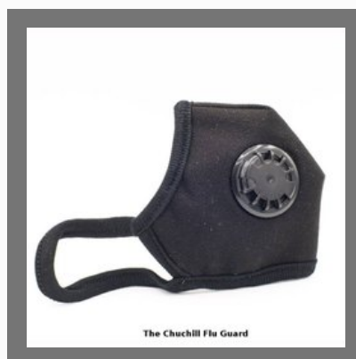
N99 Cambridge Anti-Pollution Face Mask