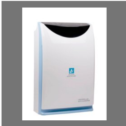
Atlanta Healthcare Universal 450 Hepa Pure Room Air Purifier