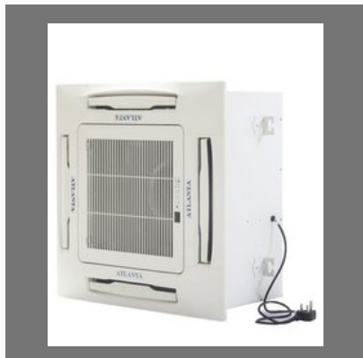
Electrostatic Air Cleaner