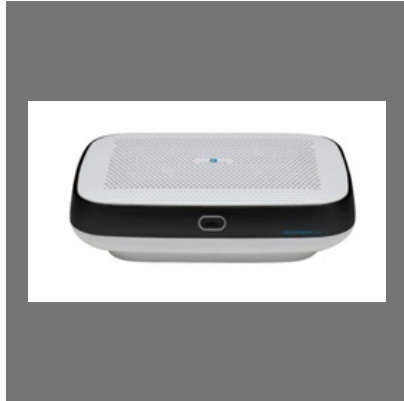
Motofresh Elite Car Air Purifier