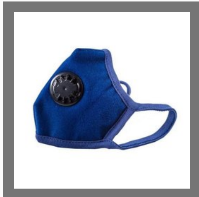
Viral Safe Face Mask N95