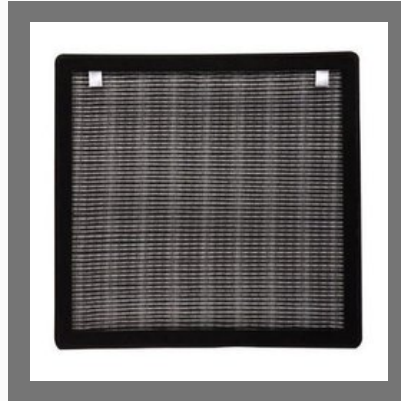
Alfa 351 HEPA Pure Filter