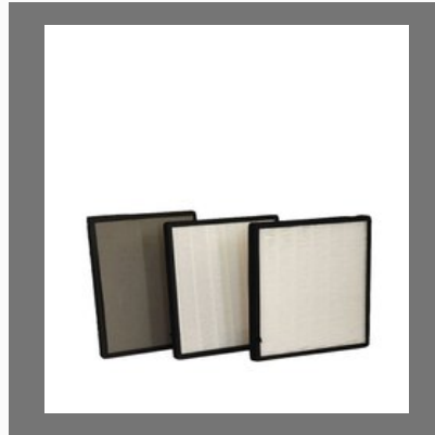
PureZone 1001 HEPA Pure Filter