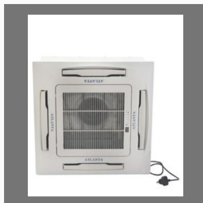
Operation Theater Air Purifier