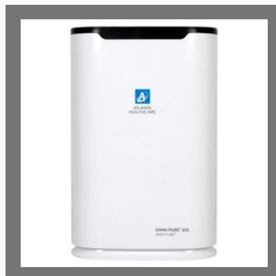
Atlanta Healthcare Gama Pure 333 Hepa Pure Room Air Purifier