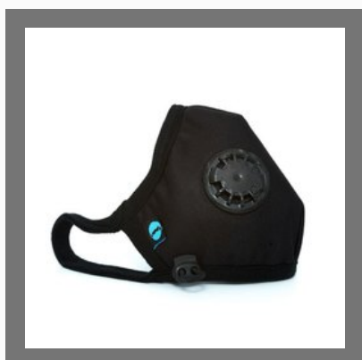
N95 Cambridge Anti-Pollution Mask Basic