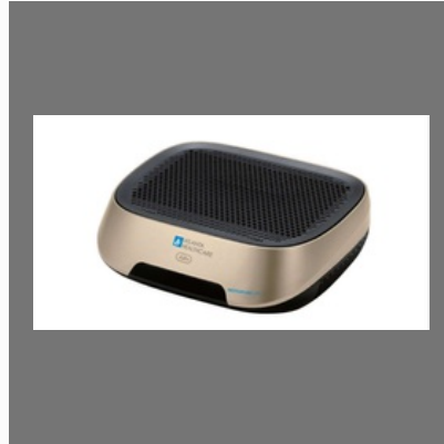
Motopure Ultra Car Airpurifier