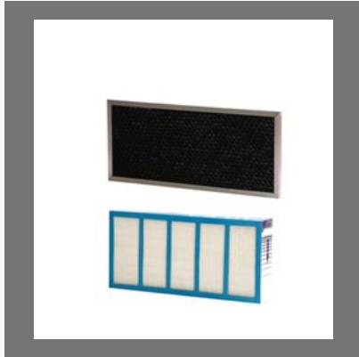
PureZone 651 HEPA Pure Filter