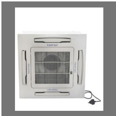
Ceiling Mount Cassette Commercial Air Purifier