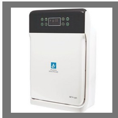
Atlanta Healthcare Beta 350 Hepa Pure Room Air Purifier