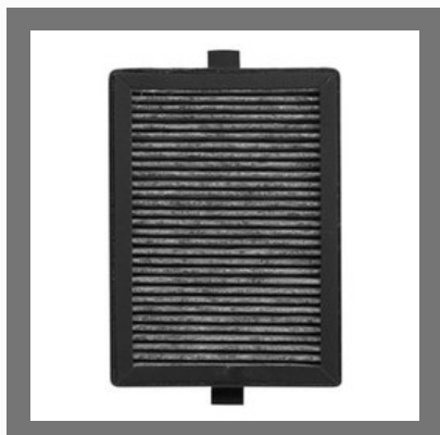
HEPA Pure Filter For Motofresh Elite Car Air Purifier