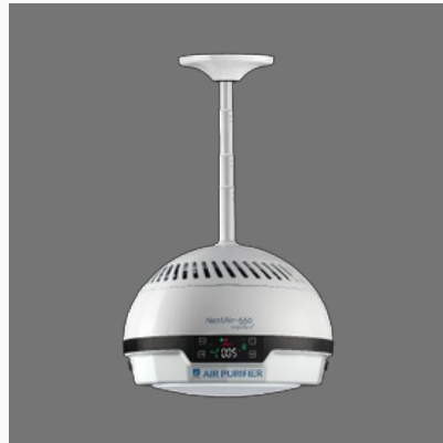
Ceiling Air Purifier Nest Air- 550