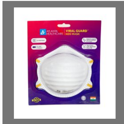
Viral Guard N95 Mask