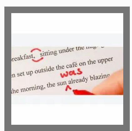
Copy Editing Service