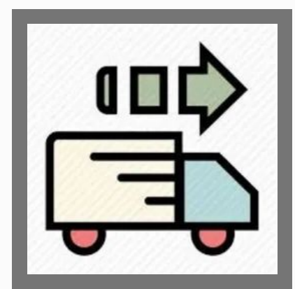
Goods Shipping Service