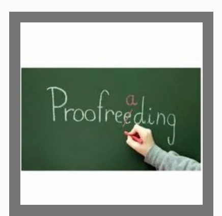
Proof Reading Service