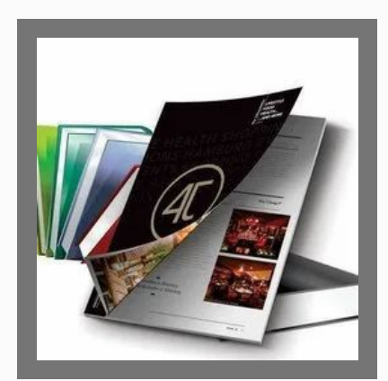
Magazine Printing Services