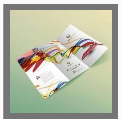
Brochure Printing Services