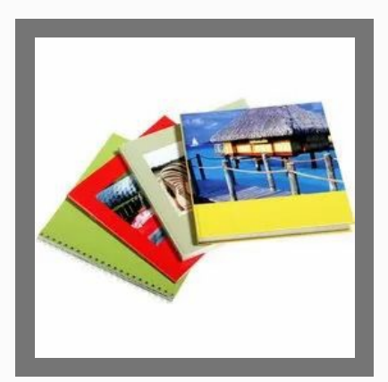
Book Publishing Service