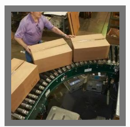
Pick And Pack Fulfillment Service