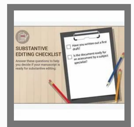
Substantive Editing Service