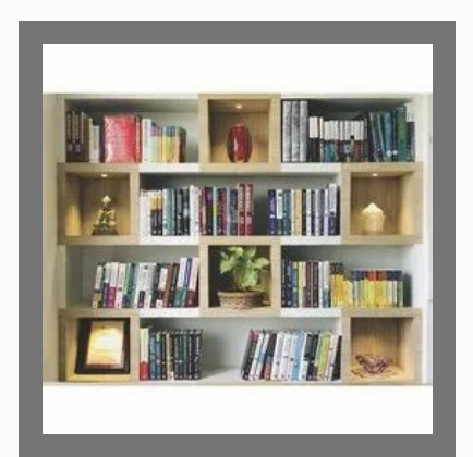
Hardcover Book Printing Service