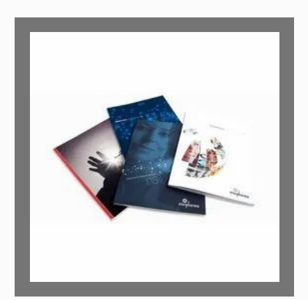
Corporate Annual Report Printing Service