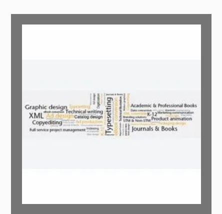
Pre Publishing Service