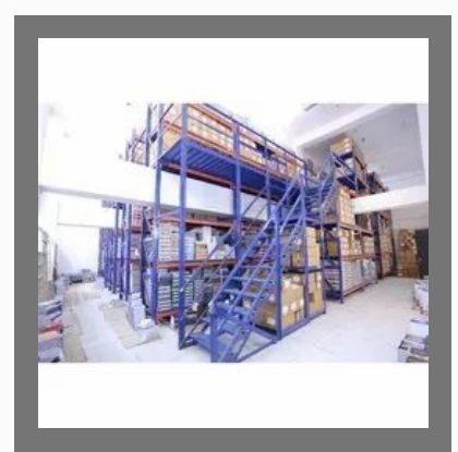
Order Fulfillment Service