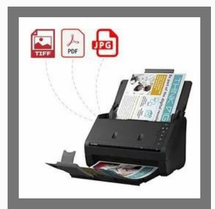
Digital Scanning Service