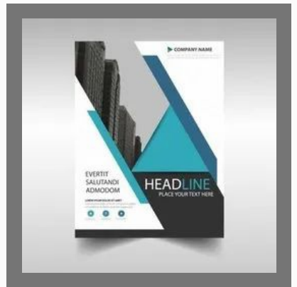
Page Interior Designing Service