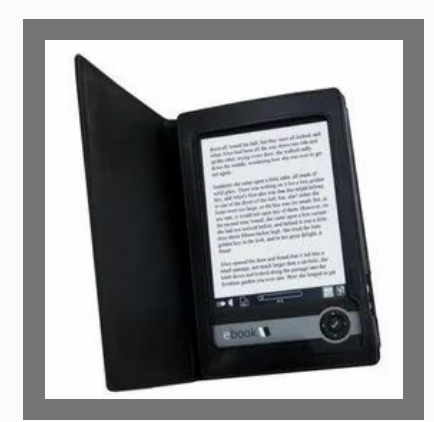
E Book Publishing Service