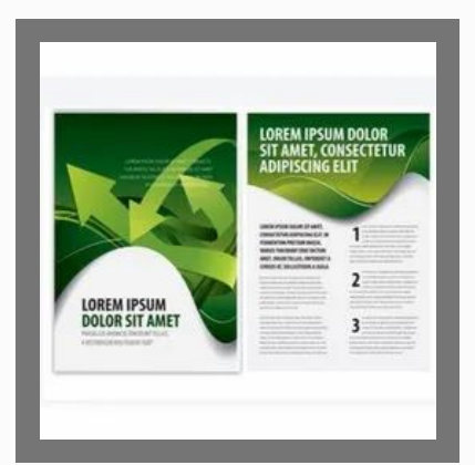
Cover Design Service