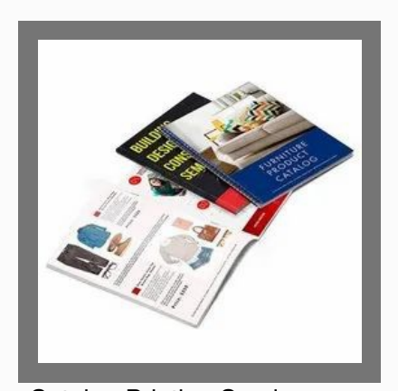
Catalog Printing Service