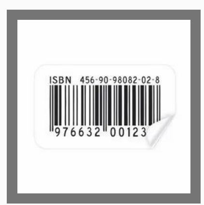
ISBN Barcode Service