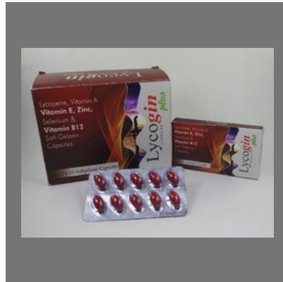
Lycogin Plus Cap