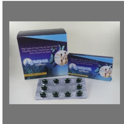
Agespan 4g Cap