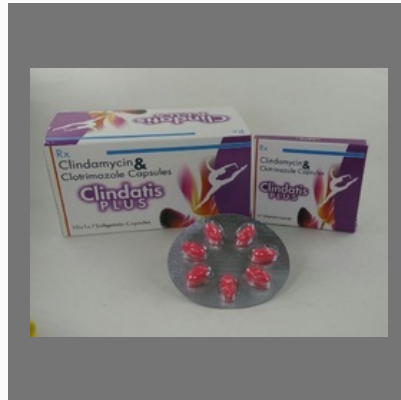
Clindatis Plus Cap