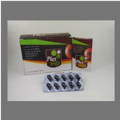
Plus Max Cap