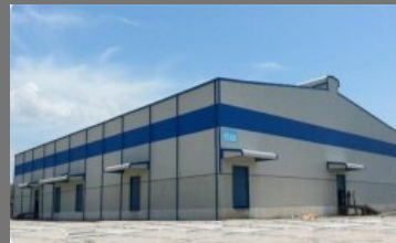
Pre Engineered Building