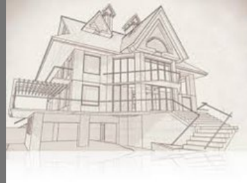
Architectural Design .