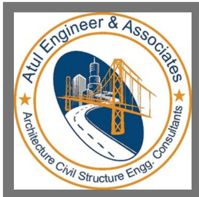
Chartered Engineering Services