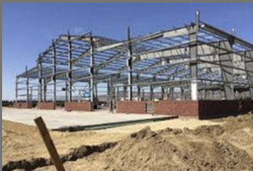
Pre Engineered Building