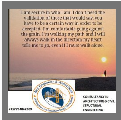
Immovable Property Valuation Services