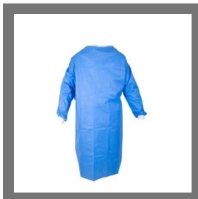
Medical Disposable Gown