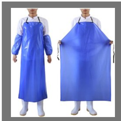
Disposable LDPE Apron