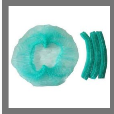
Green Disposable Surgeon Cap