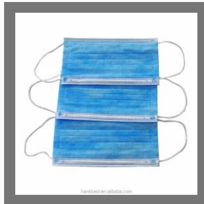
Non Woven Face Mask