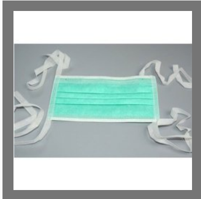
Medical Surgical Face Mask