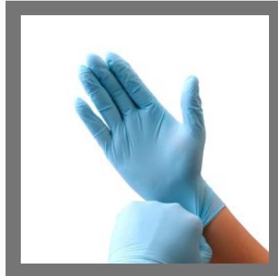
Blue Nitrile Disposable Gloves