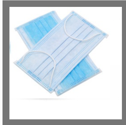
Disposable Ear Loop Face Mask