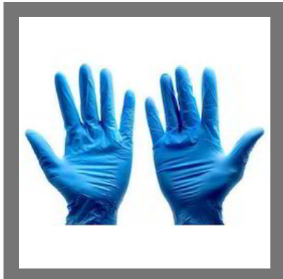
Powder Free Disposable Nitrile Gloves