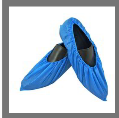
Medical Disposable Shoe Cover