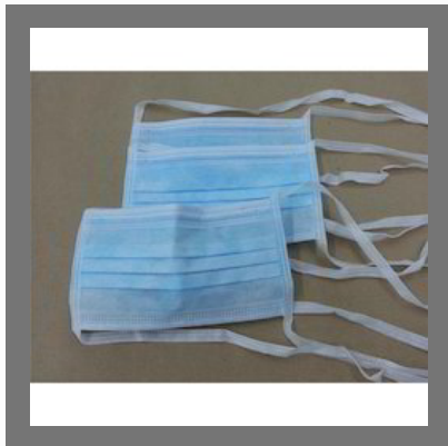
Tie On 3 Ply Face Mask