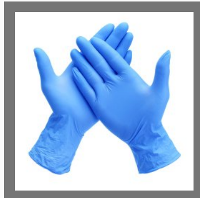
Disposable Nitrile Gloves