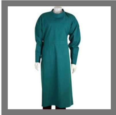
Green Surgical Gown