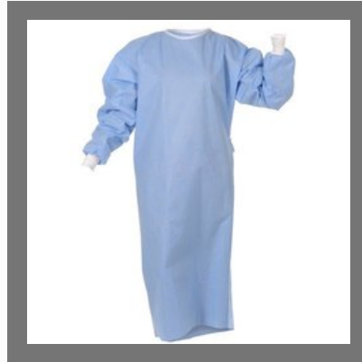
Disposable Visitor Gown