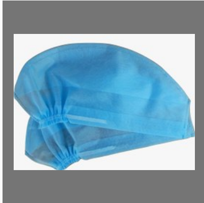
Surgeon Disposable Cap