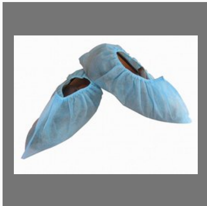
Non Woven Shoe Cover