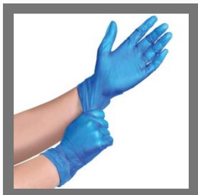
Blue Vinyl Gloves