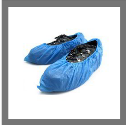
LDPE Shoe Cover