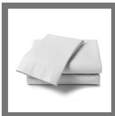
Hospital Bed Sheet