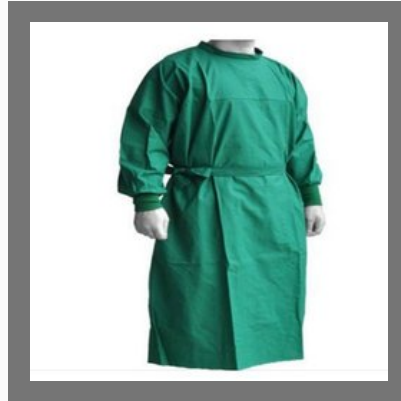
Cotton Surgical Gown