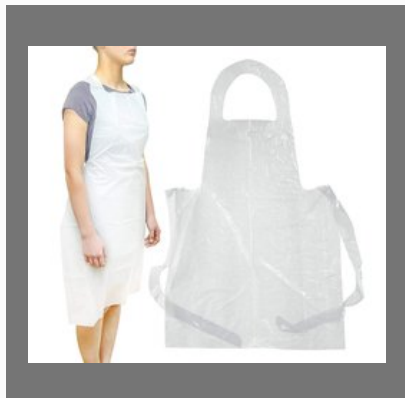
Disposable Medical Poly Apron