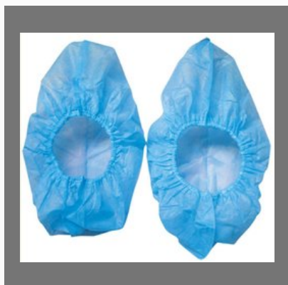
Plastic Shoe Cover