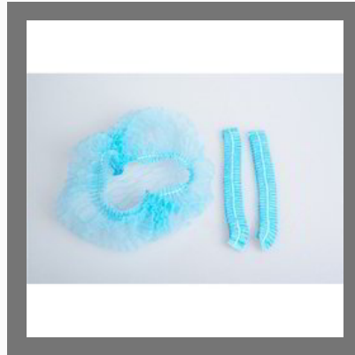
Non Woven Disposable Cap