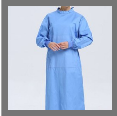
Disposable Wraparound Surgical Gown