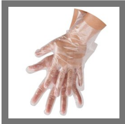
PE Disposable Gloves