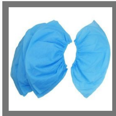
Non Woven Disposable Shoe Cover