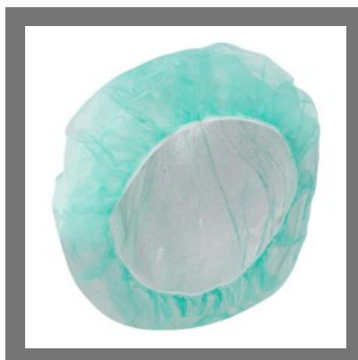
Medical Disposable Cap