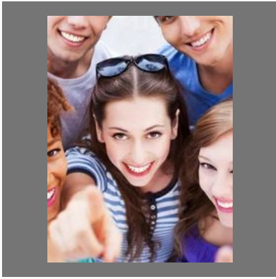
Cosmetic Dental Services