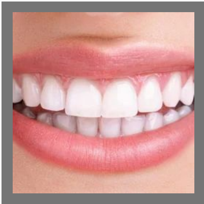
Full Mouth Rehabilitation