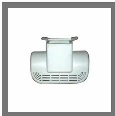
FRP Bio Medical Equipment Cover