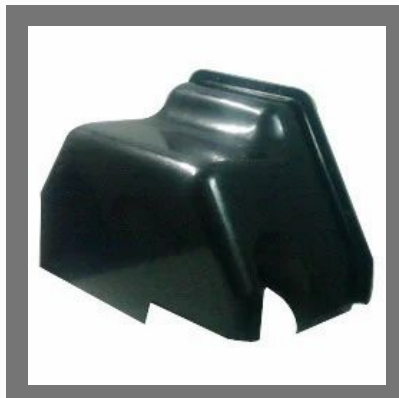
FRP Noise Shield