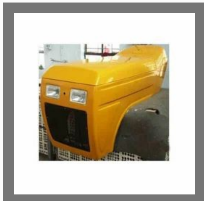
FRP Tractor Body