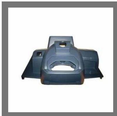
FRP Equipment Cover