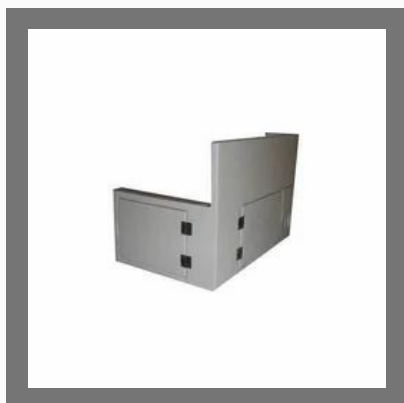
FRP Machine Cover