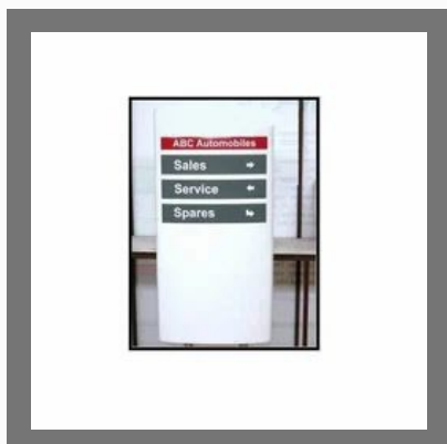
FRP Signage Board