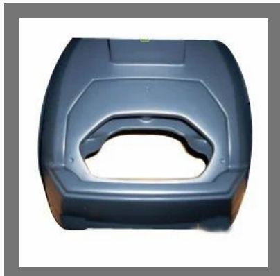
FRP Equipment Cover