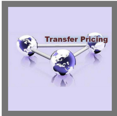
Transfer Pricing Services