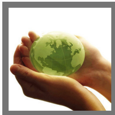
Labour Laws And Compliances