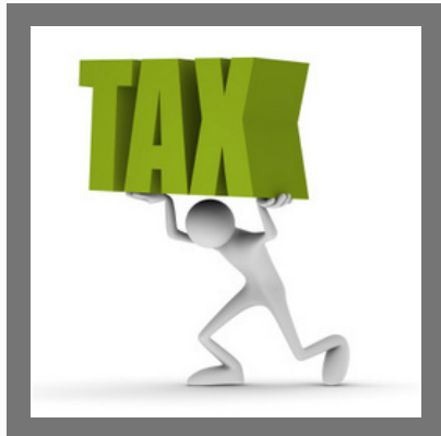
Business Taxtation Services