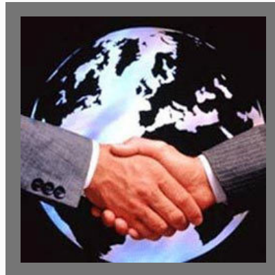
Accounts Outsourcing Service