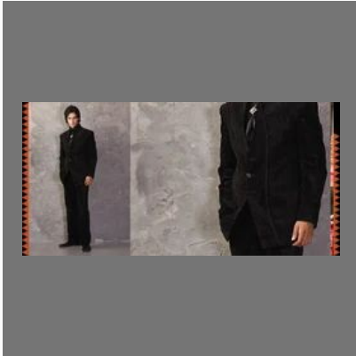
Designer Mens Suit