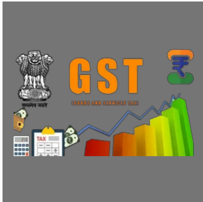
GST Annual Return Filing Services