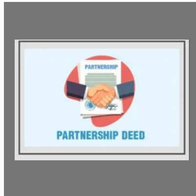
Partnership Firm Registration Service