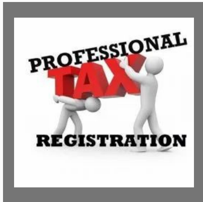
Professional Tax Registration Service