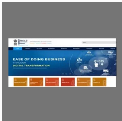
LLP Registration Service