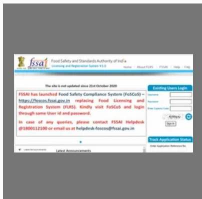
FSSAI Central License