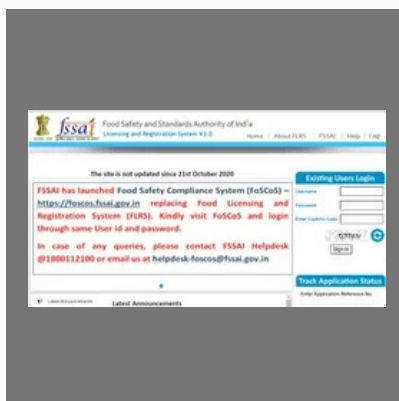
FSSAI Annual Registration Service