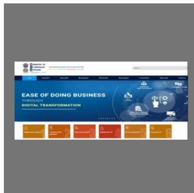
Foreign Company Incorporation Services