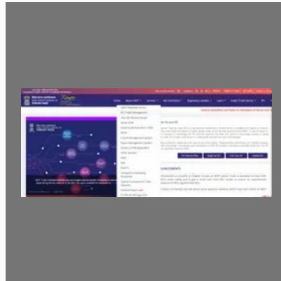
DGFT Registration Service