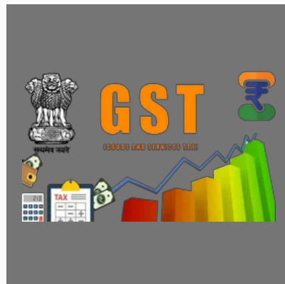
GST Reconciliation Services