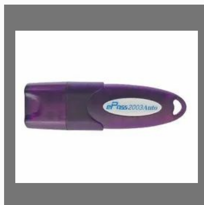
Epess 2003 Auto Pen Drive