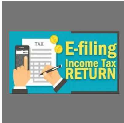
ITR-3 Rectification Revised Return Service