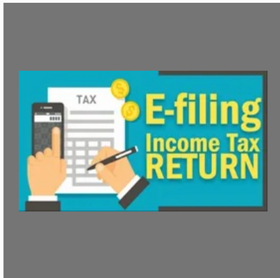
ITR-6 Rectification Revised Return Service