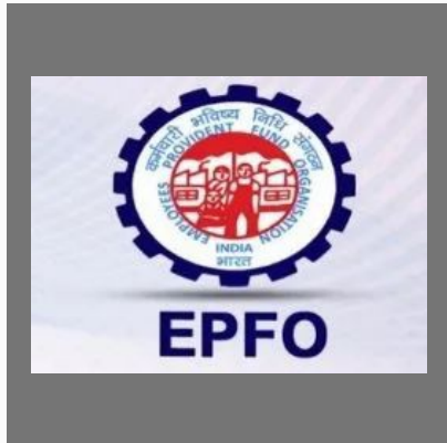
Provident Fund Registration Service