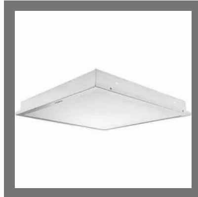
Halonix LED 2 FT Panel Light