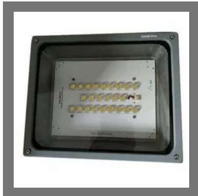
30W Halonix LED Floodlight