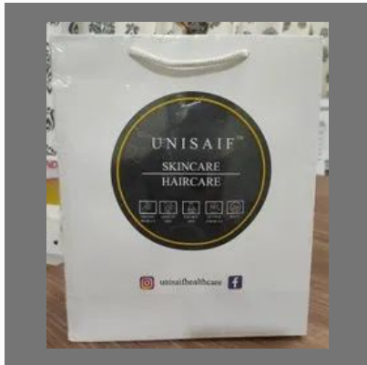
Itc Paper Bags