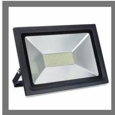
60W Halonix LED Floodlight