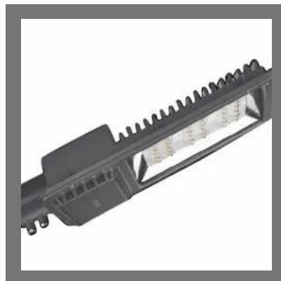
Halonix 90 Watt LED Street Light