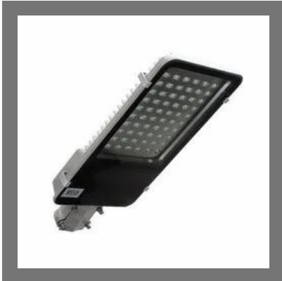
LED Street Light Syska