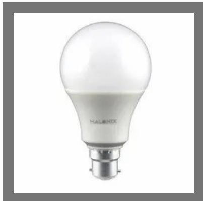
Halonix Prime 12W LED Inverter Bulb