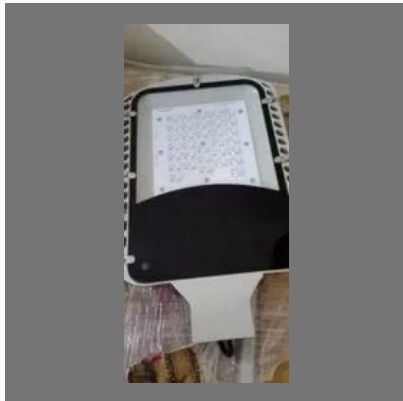
Crompton 150w led street light