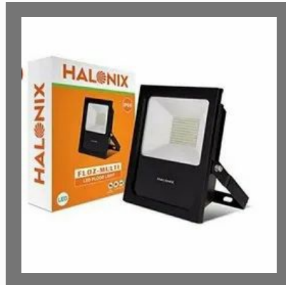
90W Halonix LED Floodlight