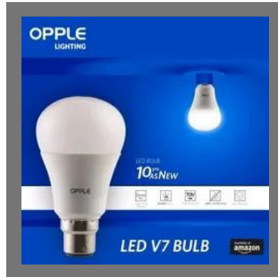
Opple 9w Led Bulb