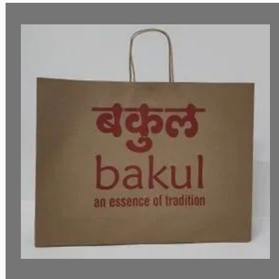
India Brown paper bag