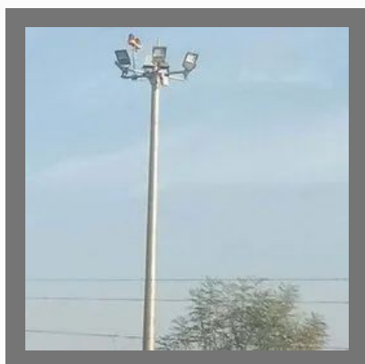
12M High Mast Lighting Pole