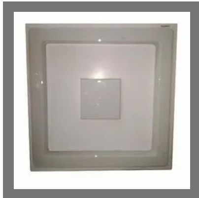
IP55 Halonix LED Street Light