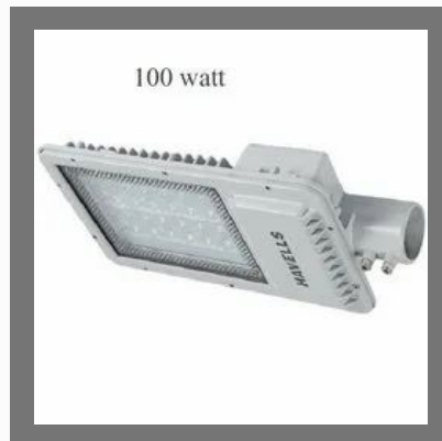
Havells Street Lights