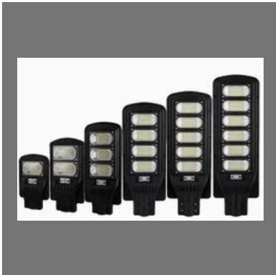
All In One Solar Street Light