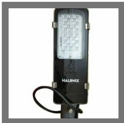
Halonix 25W LED Street Light