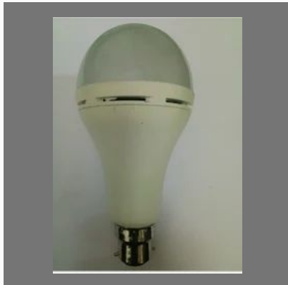
AC / DC inverter bulb 9w with 1 year warranty