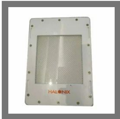
22W Halonix LED Floodlight