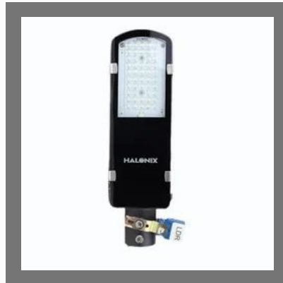
Halonix 45W LED Street Light