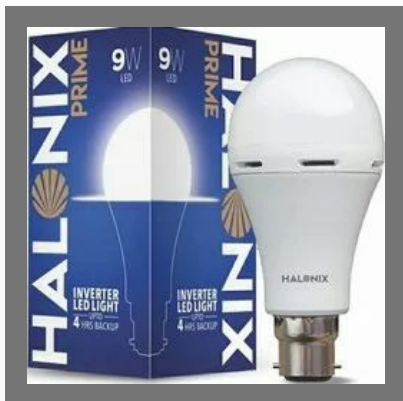
Halonix 9w Inverter Led Bulbs