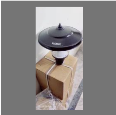
Led Post Top Light