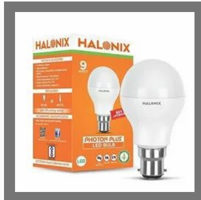
Halonix Photon Plus 9W LED Bulb