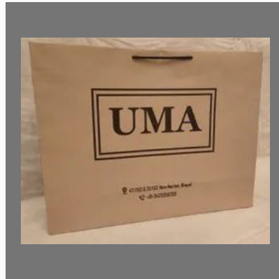
Imported Brown Kraft Paper Bags