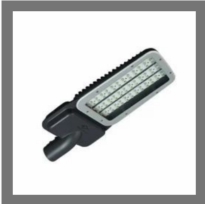
Bajaj Edge - 100W LED Street Light