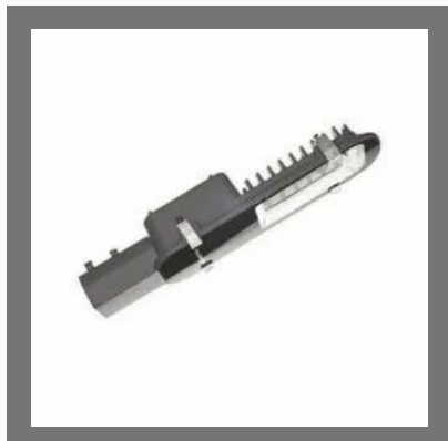
Halonix 60 Watt LED Street Light