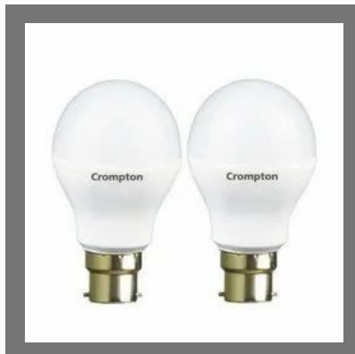
Crompton Greaves LED Bulb