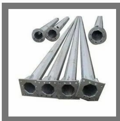
9M Octagonal Lighting Pole