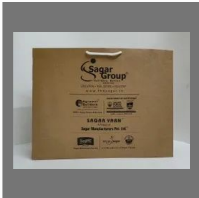
Imported Brown Kraft Paper Bags