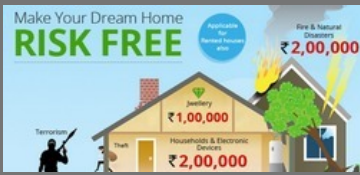
Home Insurance Service