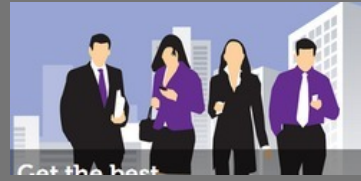
Professional Indemnity Service