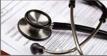
Critical Illness Policy