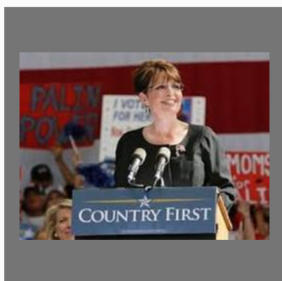
Right senior citizen plan