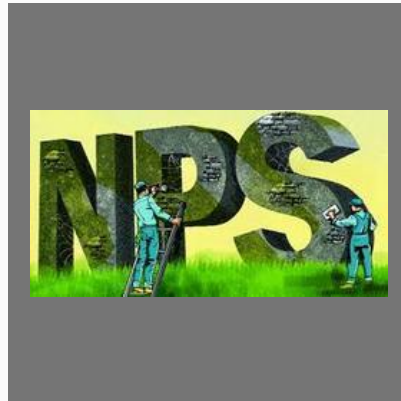
National Pension System