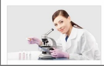
Medical Laboratory Technology Course