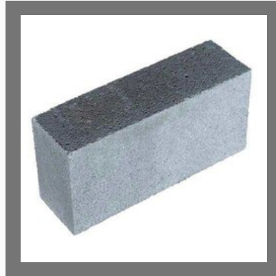
Autoclaved Aerated Concrete Block