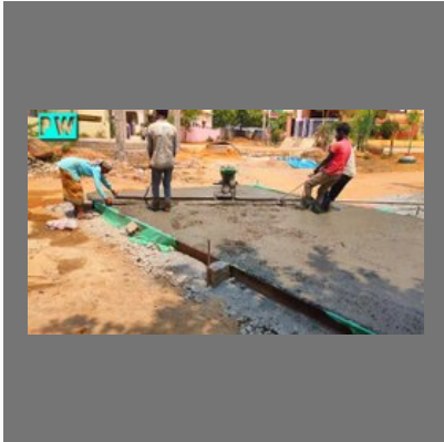
Ajax Cement Concrete Road Construction