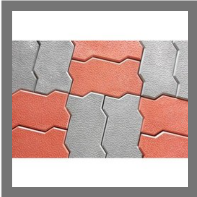
Zig Zag Paver Block