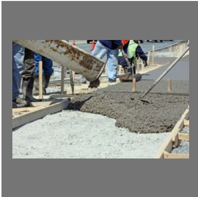
CEMENT CONCRETE ROAD SERVICE WORK