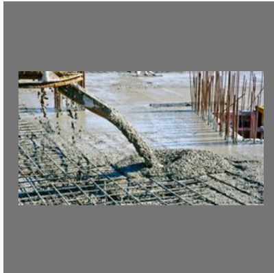
Self Loading Concrete Mixer