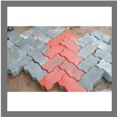
Interlocking Paver Blocks