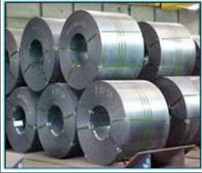
Hot Rolled Coils