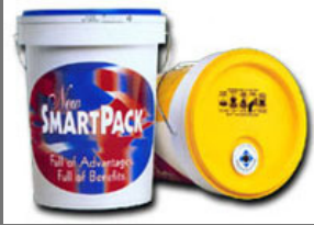
Packed With Performance