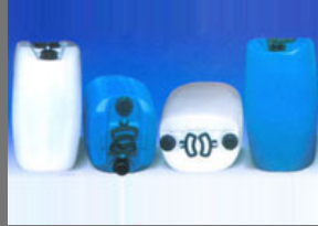
Blow Moulded Container - 50 Litre