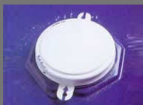
The Tri - Sure Metal Tab-Seal Cap