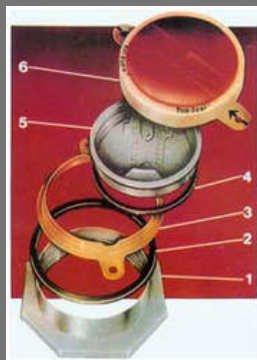
The Tri - Sure Metal System