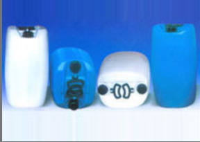
Blow Moulded Container - 50 Litre