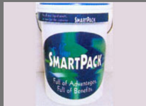
Superior Design with Larger Print Area