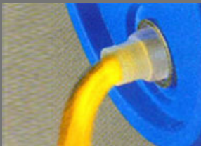
Superior Tamper Evidence