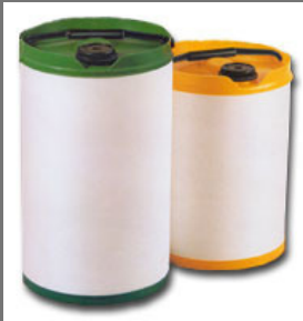
Valerex 20/25 Litre Containers