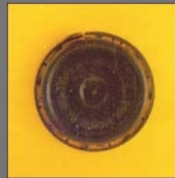
Tamper Evident Closure