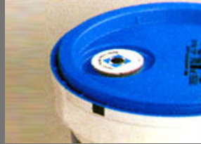
Superior Tamper Evidence