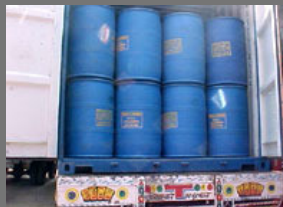
Loading in a ISO Container