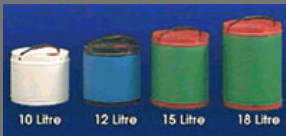
Range Of Drums