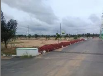
Residential Plots for Sale In Bangalore Sarjapura