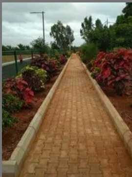
Plots On Kanakapura Road Bangalore