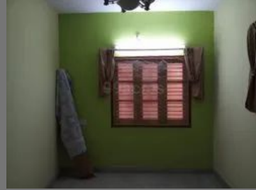
Office Space For Rent In Bangalore JP Nagar