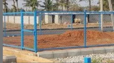
Residential Plots in bangalore kanakapura road