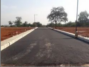
Residential Sites in bangalore Vittalasandra