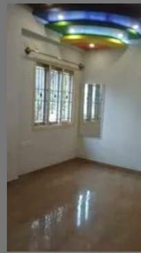
3 Bhk Flat In Koramangala bangalore