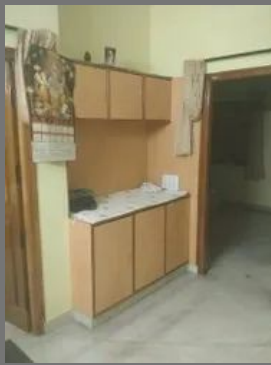
Office For Rent In Bangalore JP Nagar