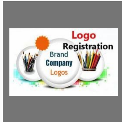
Logo Registration Service