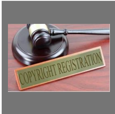
Copyright Registration Services