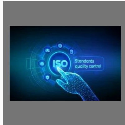
Iso 14001 Certification Service