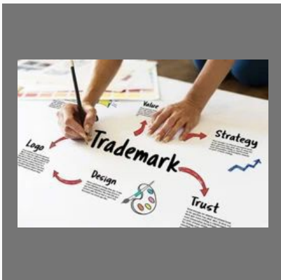
Trademark Registration Services for E-commerce