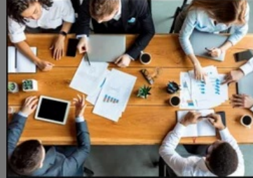
Quality Assurance and certification Service