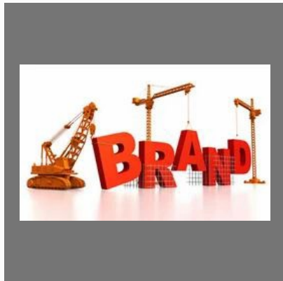
Brand Name Registration Services