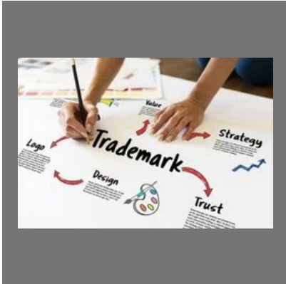
Trademark Registration Services for Manufacturing Industry.