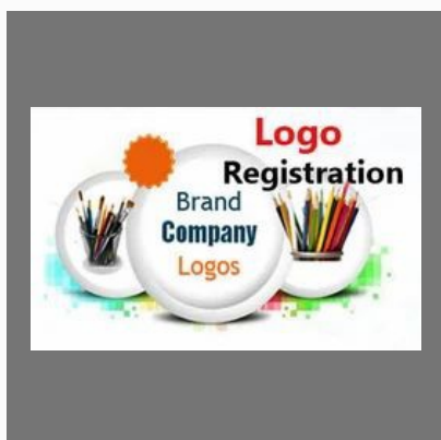
Logo Registration Services