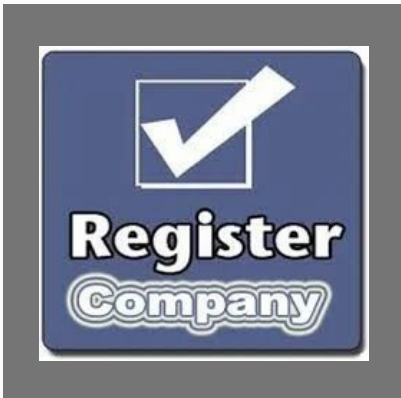
Pharmaceutical Company Registration