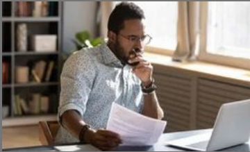
FSSAI Registration Service