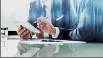
ROHS Certification Services