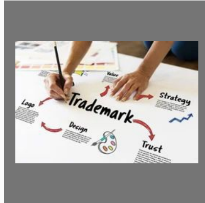
Trademark Registration for Company Logo