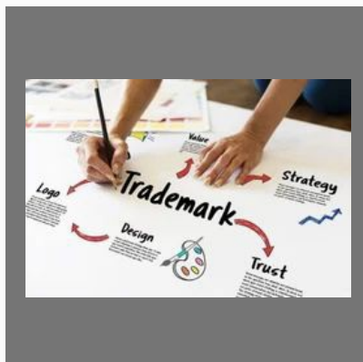
Trademark Registration Services For Electronic Industry