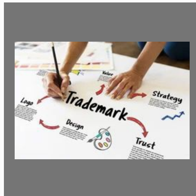
Trademark Registration Services For Construction