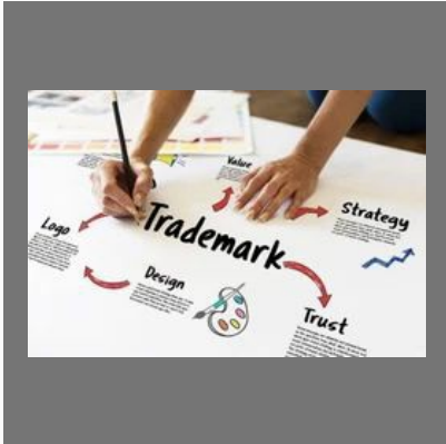
Pharmaceuticals Brand Name Registration