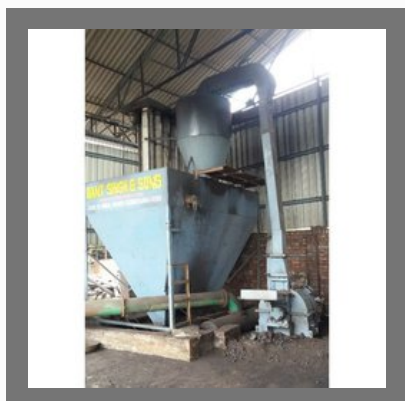
Coal Pulverizer Plant