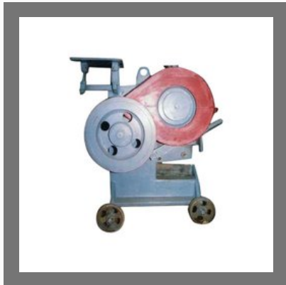
Semi-Automatic Shearing Machines