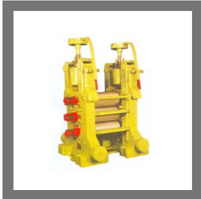
Mild Steel Rolling Mill Stand