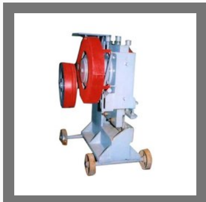
4.5 HP Shearing Machines