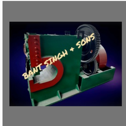
Scrap Cutting Shearing Machine