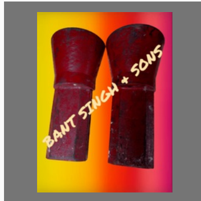
Cast Iron Rolling Mill Guide