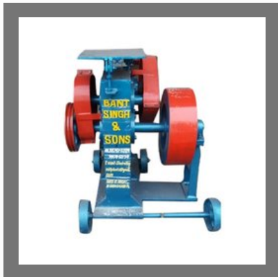
End Cutting Shearing Machine