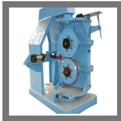
Rotary Shearing Machine