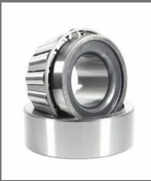
Roulement De Roue SKF Bearings