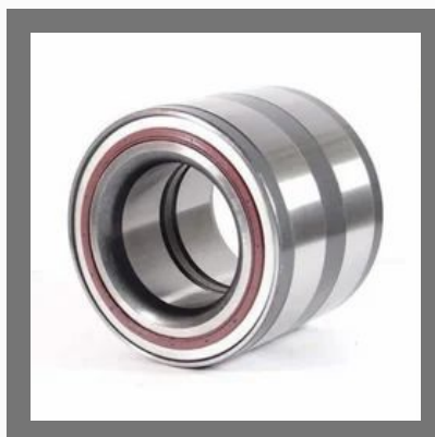
Tapered Roller Bearing