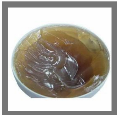
Semi-Fluid Gear Grease