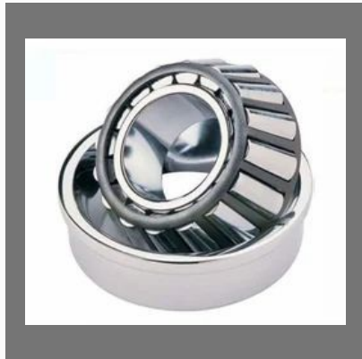
Cuscinetti A Rulli Conici Bearings