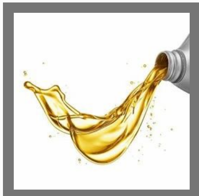
Mobil Lubricant Oil