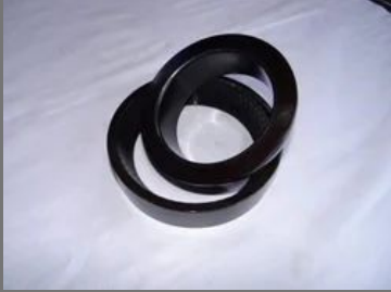
Rubber Bearing Seals