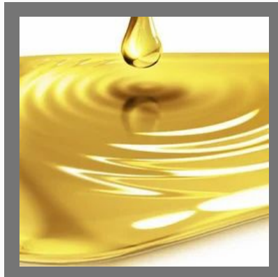
Lubricant Base Oil