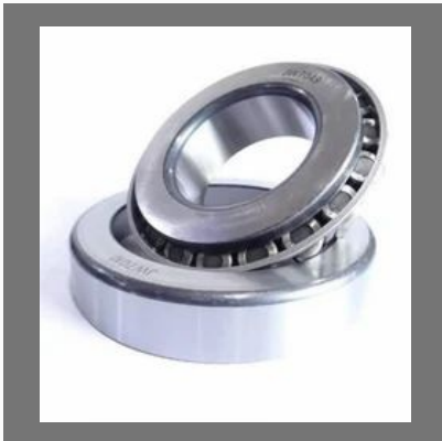
Leading FAG Bearing