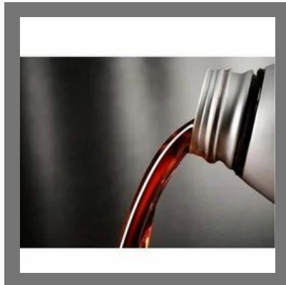
Automotive Engine Oil