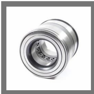
Tapered Roller Bearing