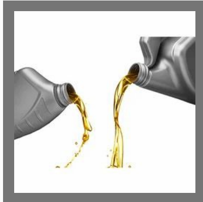
Diesel Engine Oil