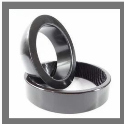
Tapered Roller Bearing