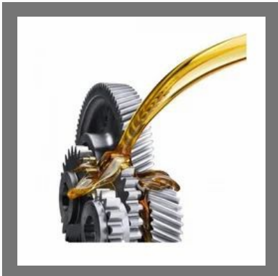
Gear Lubricant Oil