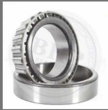
Leading FAG Bearing