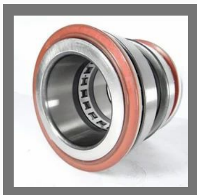
Tapered Roller Bearing