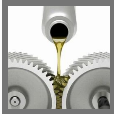
Industrial Lubricant Oil