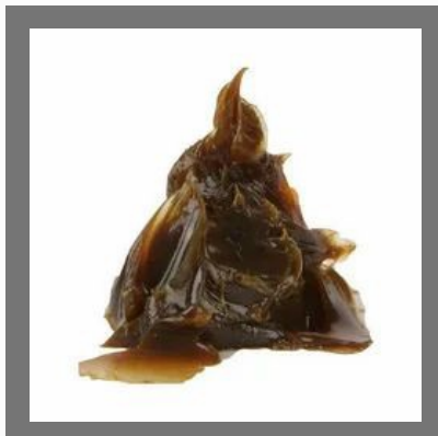
Automotive Lubricant Grease