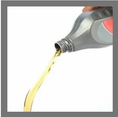
Automotive Lubricant Oil