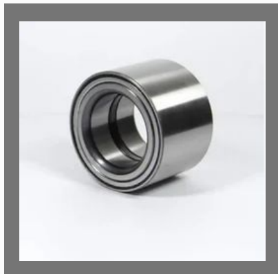
Tapered Roller Bearing