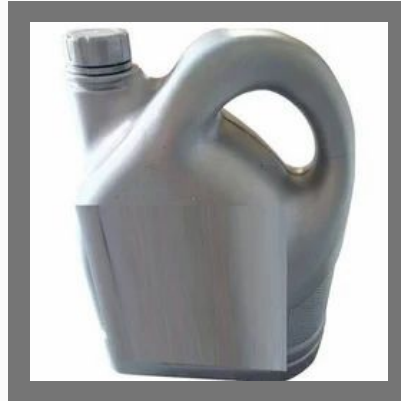
Air Compressor Oil