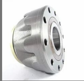
Roulement De Roue SKF Bearings