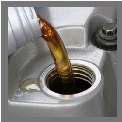
Motor Engine Oil