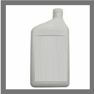
Air Compressor Base Oil