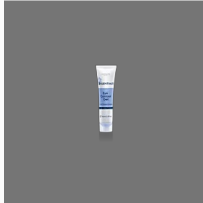
B And S Essential Eye Contour Gel