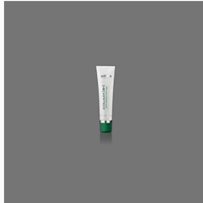
Ecollagen Anti Wrinkle Eye Care Cream