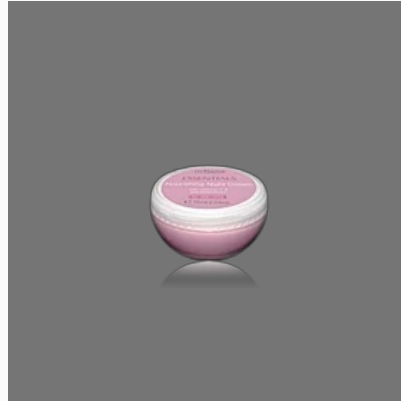
Essentials Nourishing Night Cream