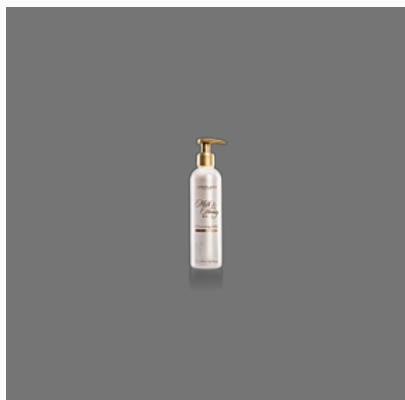
Milk And Honey Gold Cleansing Milk