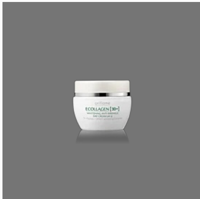
Ecollagen Whitening Anti Wrinkle Cream