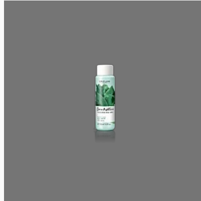
Love Nature Cleansing Gel Tea Tree