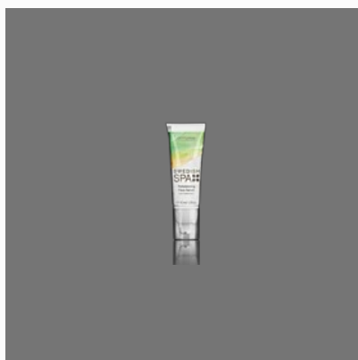
Swedish Spa Rebalancing Face Serum