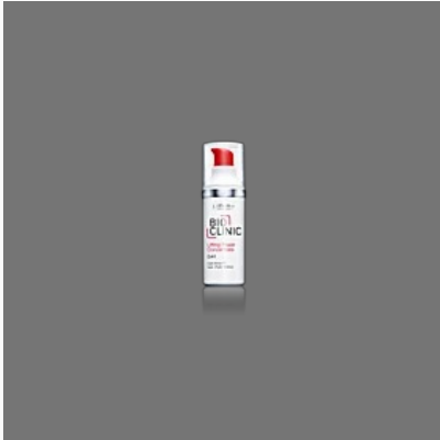
Bioclinic Lifting Power Concentrate Day