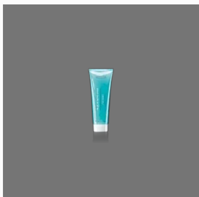
Aqua Rhythm Intense Hydration Youth