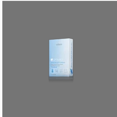
Optimals Oxygen Boost Capsules