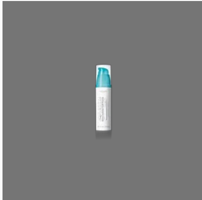
B And S Aqua Rhythm Intense Hydration