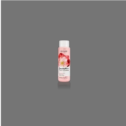
Love Nature Cleanser Wild Ro