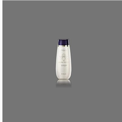
Royal Velvet Soothing Toner