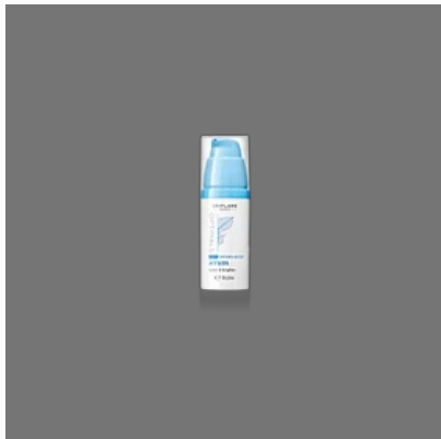
Optimals White Oxygen Boost Serum