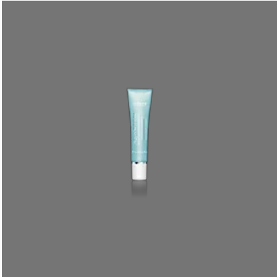
Aqua Rhythm Intense Hydration Youth