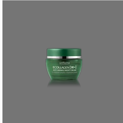
Ecollagen Anti Wrinkle Night Cream