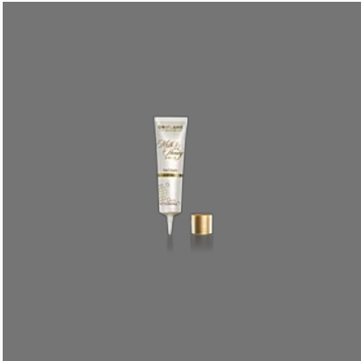
Milk And Honey Gold Eye Cream