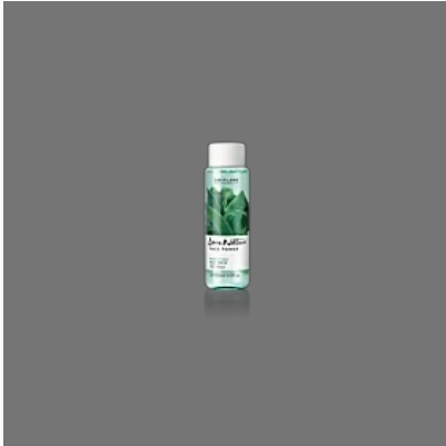
Love Nature Face Toner Tea Tree