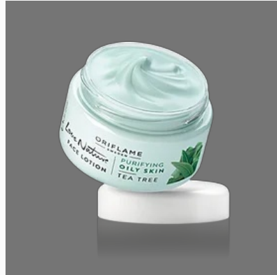
Love Nature Face Lotion Tea Tree