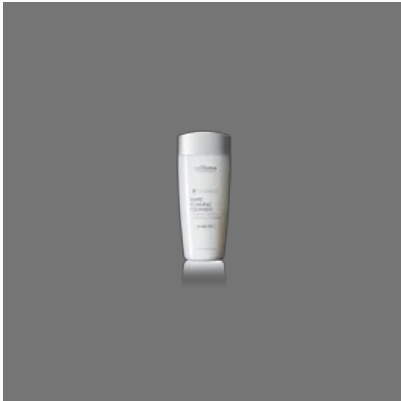
B And S Optimals White Foaming Cleanser