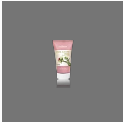
Pure Nature Organic Burdock Extract