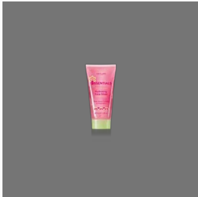
B And S Essentials Hydrating Face Mask