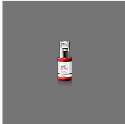
Bioclinic Adult Skin Anti Breakout