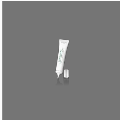
Ecollagen Whitening Anti Wrinkle Cream