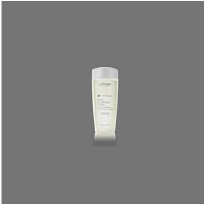
B And S Optimals White Clarifying Toner