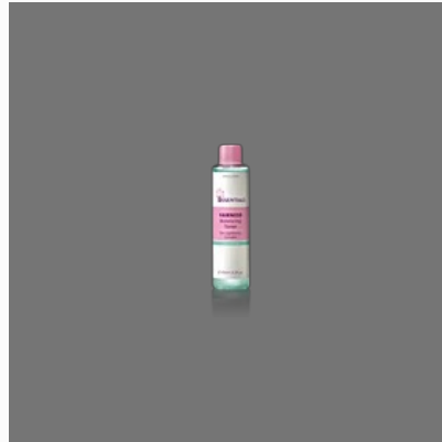
Essentials Fairness Balancing Toner