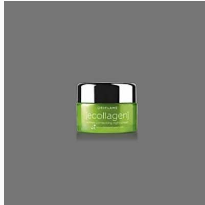
Ecollagen Wrinkle Correcting Night Cream