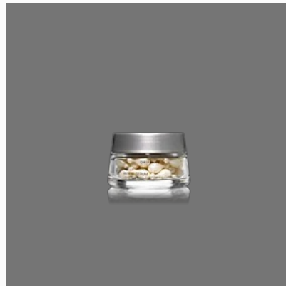
Optimals White Serum 28