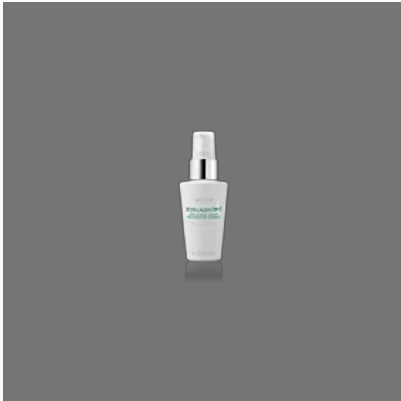
Ecollagen Whitening Night Cream