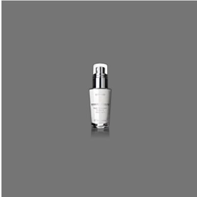
Diamond Cellular Night Restorative