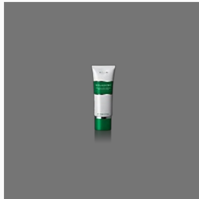
Ecollagen Intensive Anti Wrinkle Cream