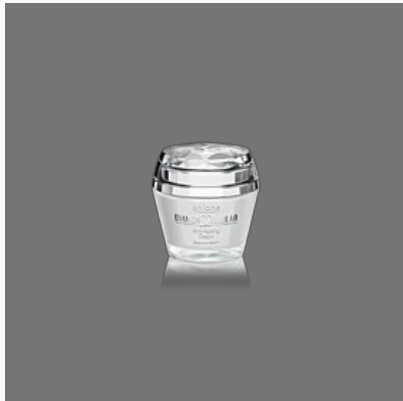
Diamond Cellular Anti Ageing Cream