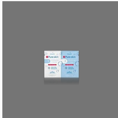
Pure Skin 1 Clarifying Scrub 2 Purifying