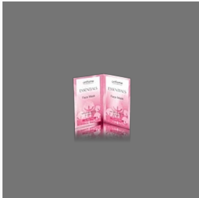
Essentials Face Mask