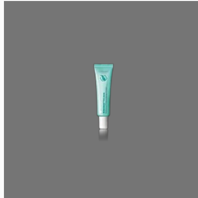
Optimals BioMaximum Eye Cream