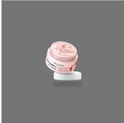
Love Nature Day Cream Wild Rose