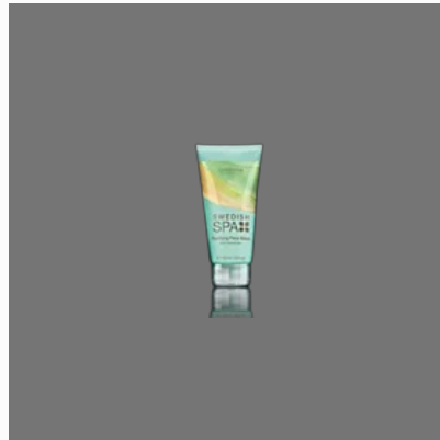
Swedish Spa Purifying Face Mask