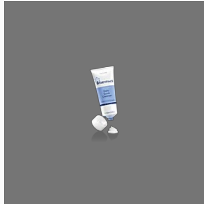
Essentials Daily Scrub Cleanser