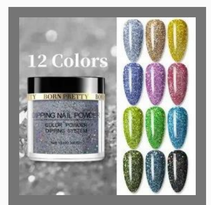
Born Pretty Acrylic Dipping Nail Powder