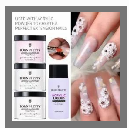
Born Pretty Extension Nail Acrylic Powder Kit