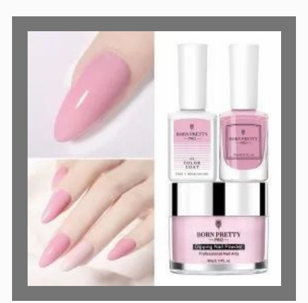
Born Pretty Pro Nail Matching Kit