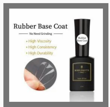
Born Pretty Pro Nail Rubber Base Coat