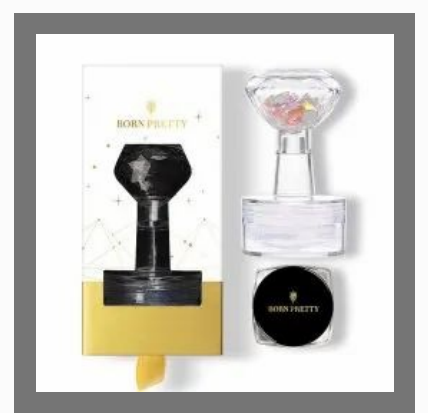
Born Pretty Nail Art Stamper