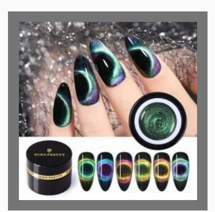
Born Pretty Cat Eye Nail Polish