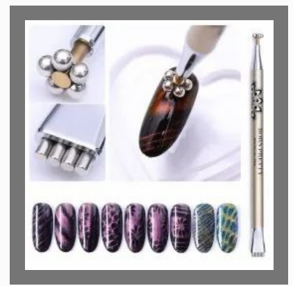
Born Pretty Nail Magnetic Pen