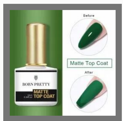
Born Pretty Nail Matte Top Coat