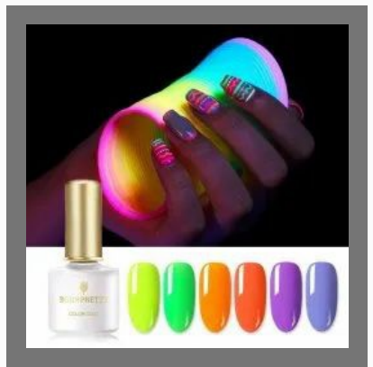
Born Pretty Radium Nail Polish