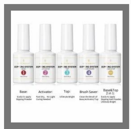
Born Pretty Dipping Nail Powder Kit