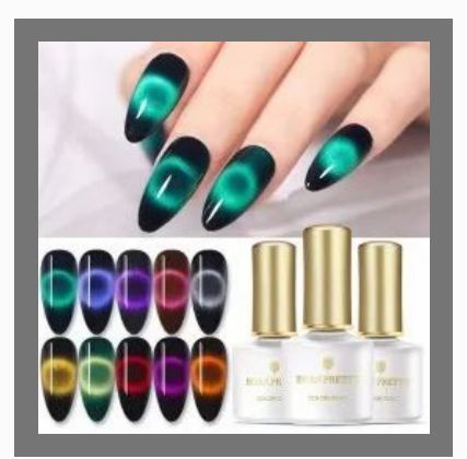
Born Pretty Cat Eye Gel Nail Polish