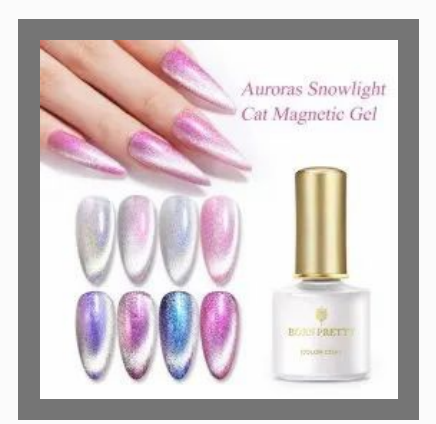
Born Pretty Auroras Snowlight Cat Magnetic Gel Nail Polish