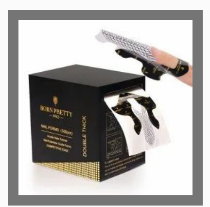
Born Pretty Nail Form