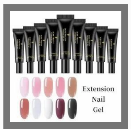
Born Pretty Extension Gel Nail Polish