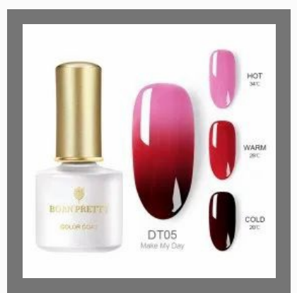
DT05 Born Pretty Temperature Changing Nail Polish