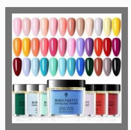
Born Pretty Dipping Nail Powder