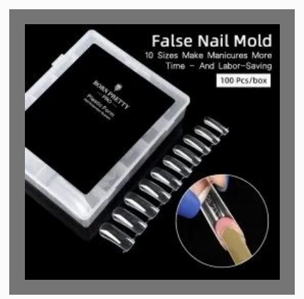
Born Pretty False Nail Mold