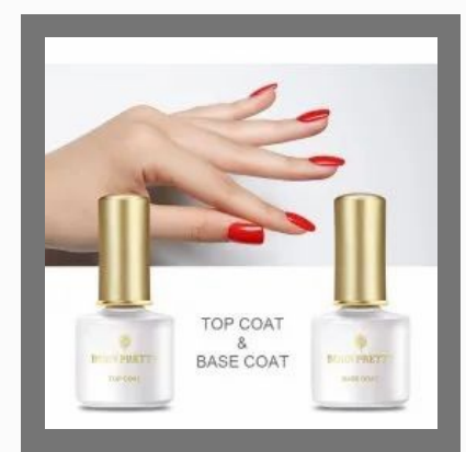
Born Pretty Top Base Nail Coat