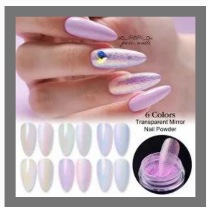
Born Pretty Transparent Mirror Nail Powder