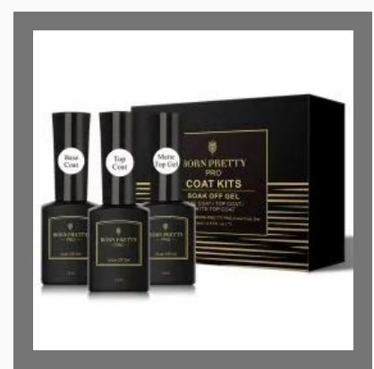
15ml Born Pretty Pro Nail Top Coat Kit