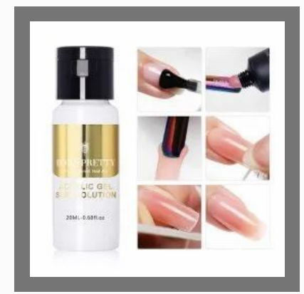
Born Pretty Slip Solutions Nail Art