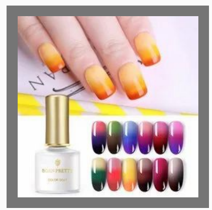
UV Nail Gel Polish