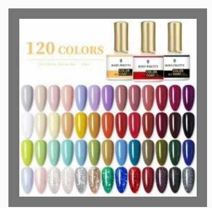
Born Pretty Gel Nail Polish