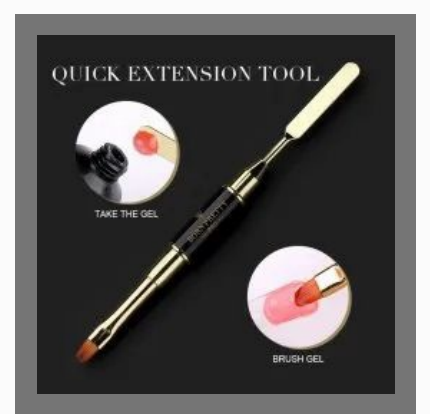
Born Pretty Pro Quick Nail Extension Brush