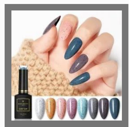
Born Pretty Nail Shell Coat