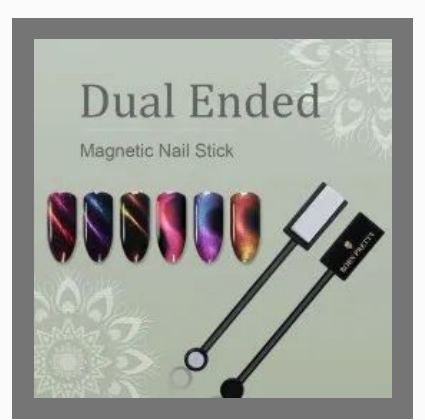
Born Pretty Dual Ended Magnetic Nail Stick