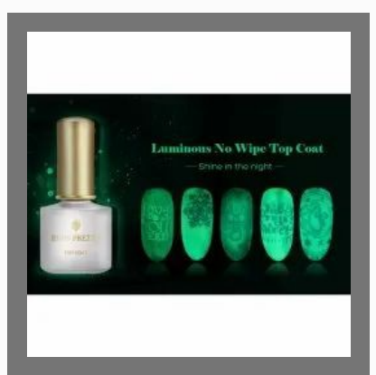
Born Pretty Nail Luminous Wipe Top Coat