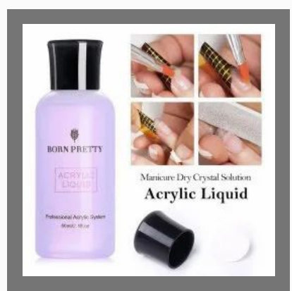
Born Pretty Acrylic Liquid Nail Art