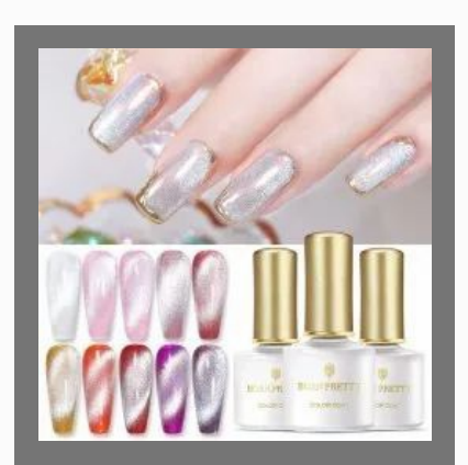
Born Pretty Cat Eye Magnetic Gel Nail Polish