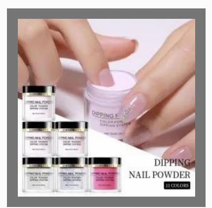
Born Pretty Dipping Nail Powder