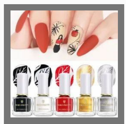
Born Pretty Stamping Nail Polish