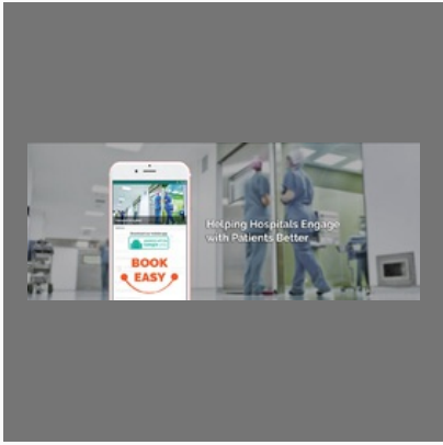
Easy To Book Cancel Appointments Services