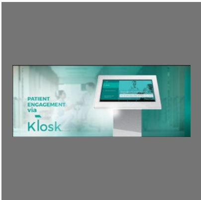
No More Queues And Long Waiting Times Services