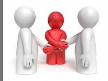
Conciliation Alternate Dispute Resolution