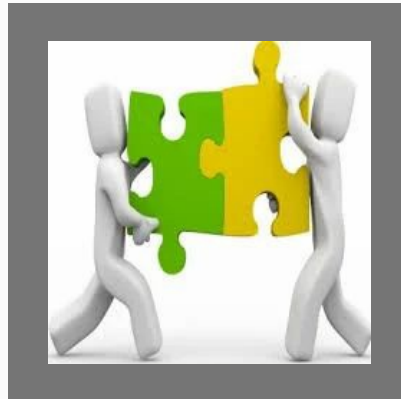
Mergers and Amalgamations