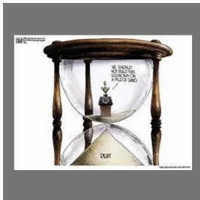
Mismanagement and Oppression