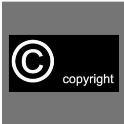
Copyrights & Designs