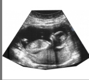
Ultrasound Treatment Service