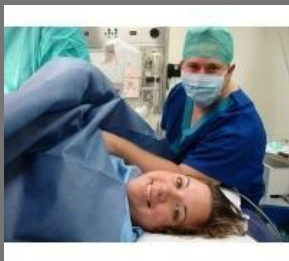
Painless Deliveries Treatment Service