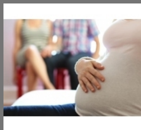
Infertility Centre With IUI Lab For Childless Couples Treatment