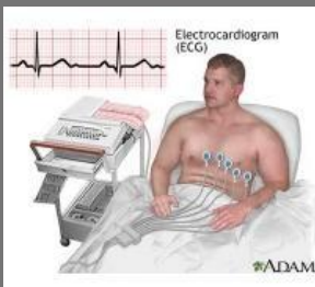
ECG Treatment Service