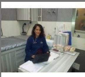
Computerised Lab Reports Service