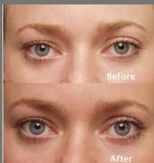
Skin Plastic Surgery & Cosmetic Surgery Treatment Service