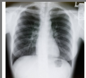
X-Ray Treatment Service