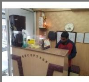
OPD Treatment Service