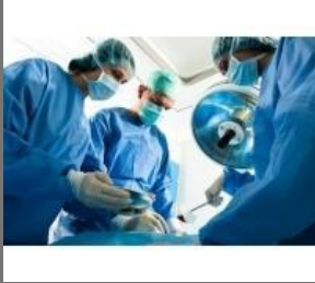
General Surgery Treatment Service