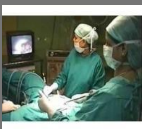
Laproscopy Treatment Service