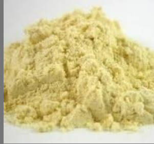
Vsr Corn Flour