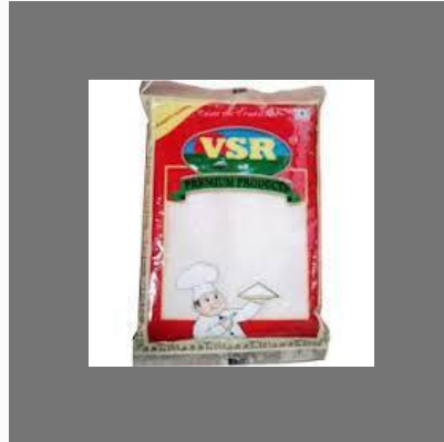
Vsr Wheat Rawa