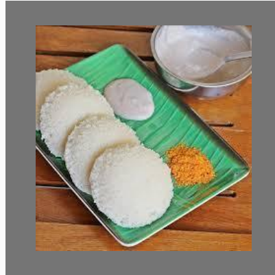
Vsr Idly Rawa .