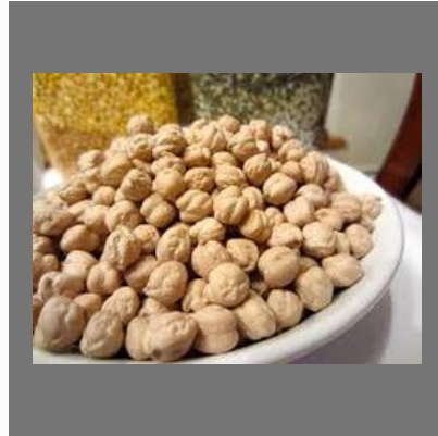
Vsr Kabuli Channa