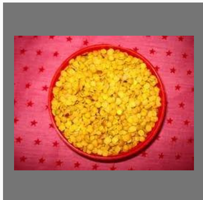
Vsr Toor Dal