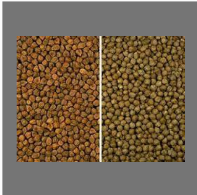
Vsr Bengal Gram Rstd