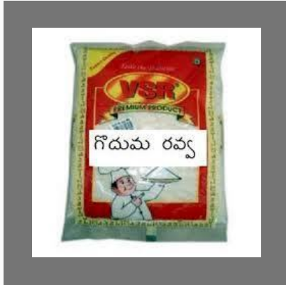
Vsr Broken Wheat