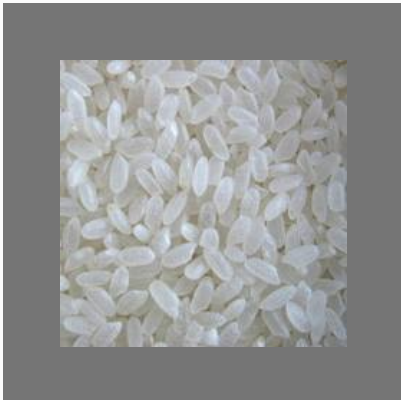
Vsr Kurnool Sonamasoori Rice