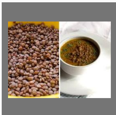
Vsr Masoor Whole