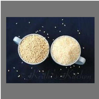
Vsr Idly Rice