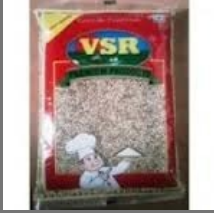
Vsr Ragi Flour