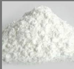
Vsr Rice Flour