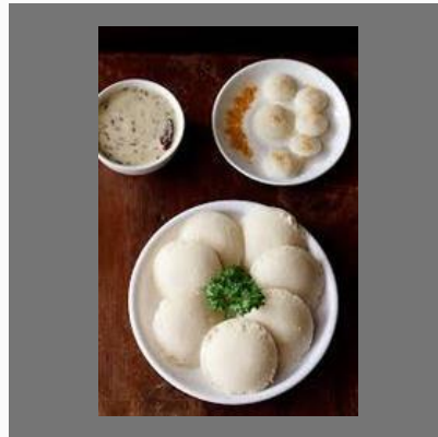
Vsr Idly Rawa Dry