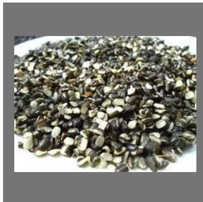
Vsr Urad Dal