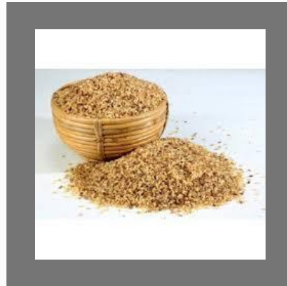
Vsr Handpound Rice