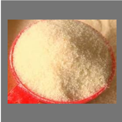
Vsr Rice Rawa