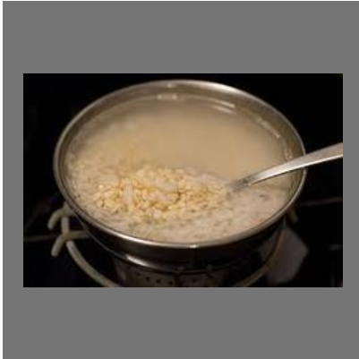
Vsr Idly Rawa