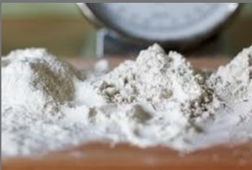
Vsr Jawar Flour