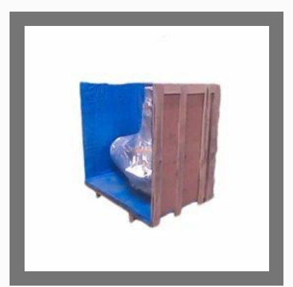
Seaworthy Packing Boxes