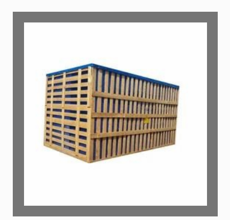
Heavy Duty Wooden Boxes