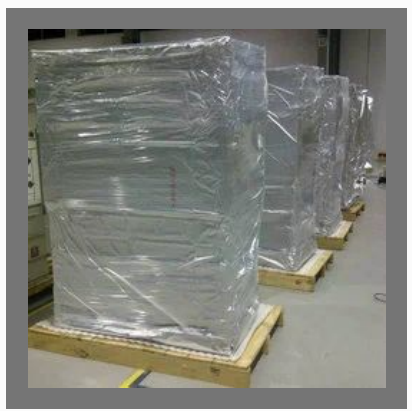
Vacuum Packing Box