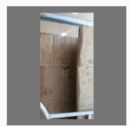
Packaging BoPacking Box Cover Materialx Cover