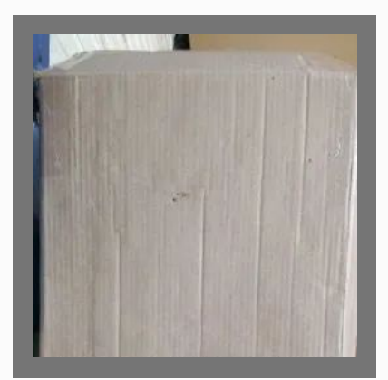
Packaging Box Material