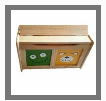
Rubber Wood Box