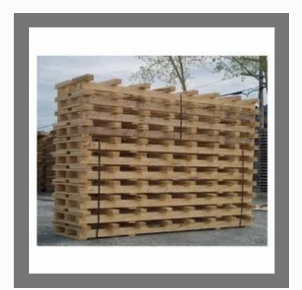
Packing Wooden Pallets