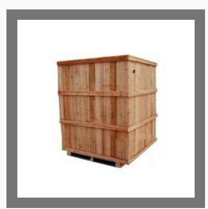
Wooden Packing Cases