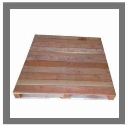
Heavy Wooden Pallets