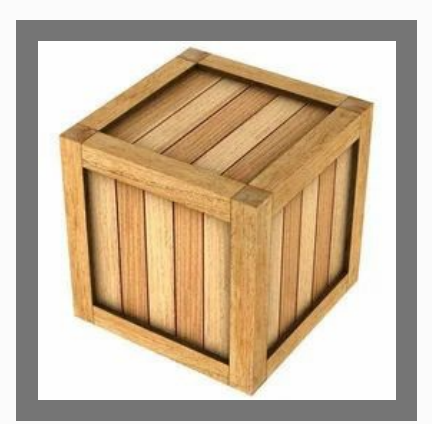
Wooden Packaging Box