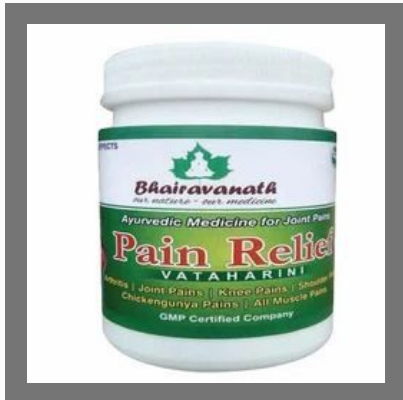
Joint Pain Tablet