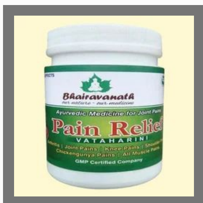
Knee Pain Tablet