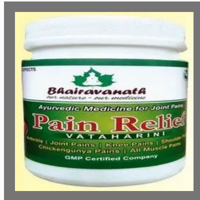
Knee Pain Tablets