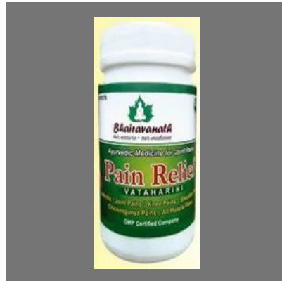
Joint Pain Relief Tablets