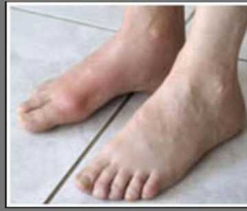
Acidity Homoeopathy Treatment Service