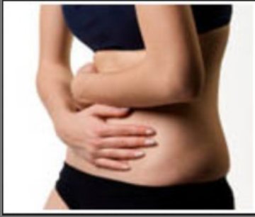
Abdominal Colic Homoeopathy Treatment Service