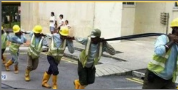
Fabrication Of Cable Supporting Structures