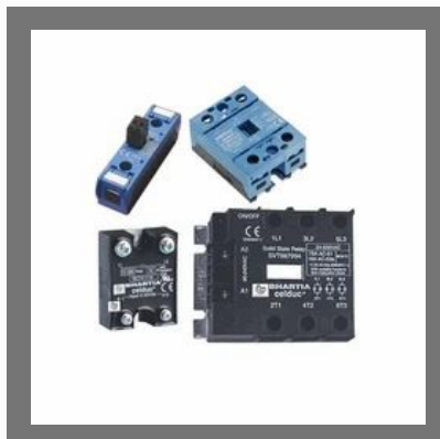
BCH SC941160 12 Amp Solid State Relay