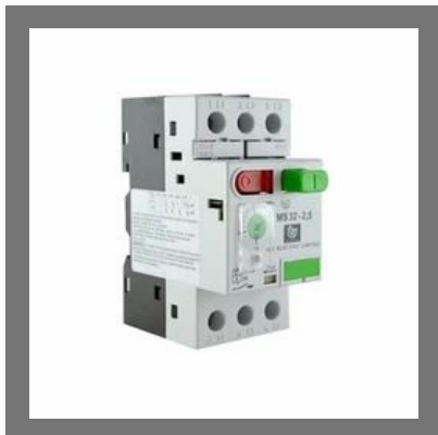
BCH 690 V Motor Protection Circuit Breaker