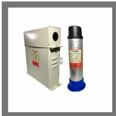
BCH 3 kV AC Cylindrical Normal Duty LT Capacitor