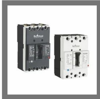
BCH RS 75 x 130 x 60 mm Moulded Case Circuit Breakers