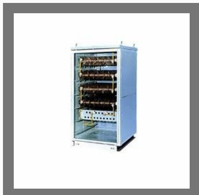
BCH WL 10 0.1 Ohm Punched Grid Resistors