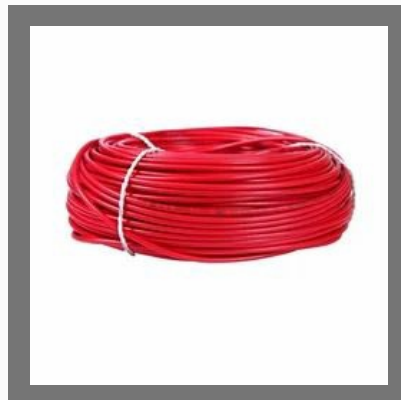
BCH 0.5 to 50 Square mm FR and FR-LSH Cable