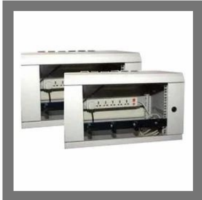
BCH BIL-W-6-5504 360 mm XE Wall Mount Racks