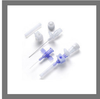
Vasofix IV Cannula