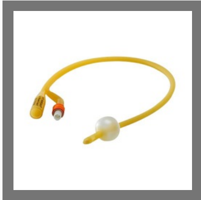
Rusch Foley Catheter