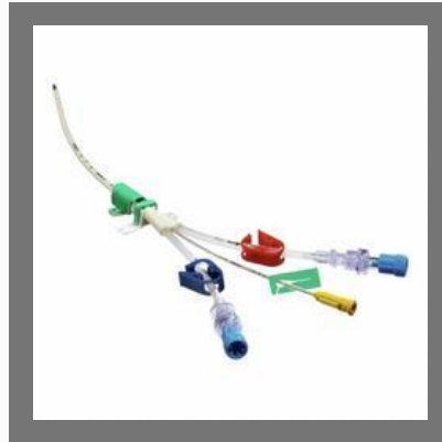
Trio Triple Lumen Catheter