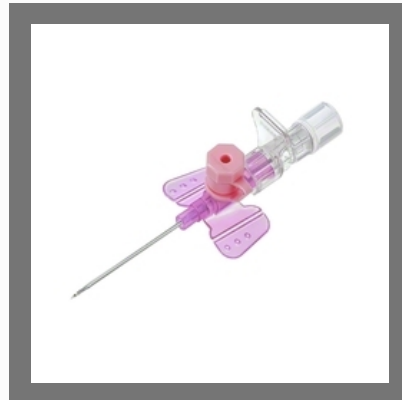
Vasofix Safety Cannula