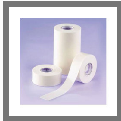
Surgical Adhesive Tape