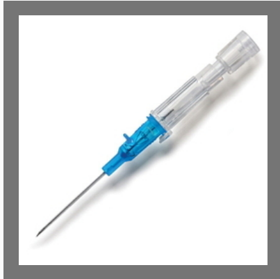
Polyurethane Straight Iv Catheter