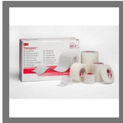
3m Transpore Tape