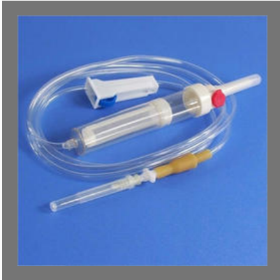
Disposable Infusion Set