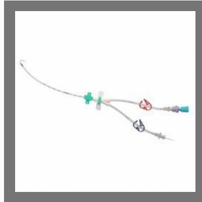
Double Lumen Catheter