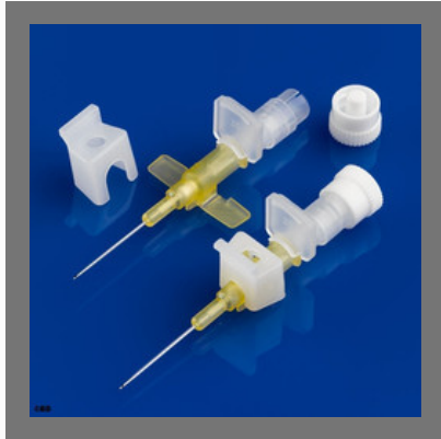
Neoflon IV Cannula