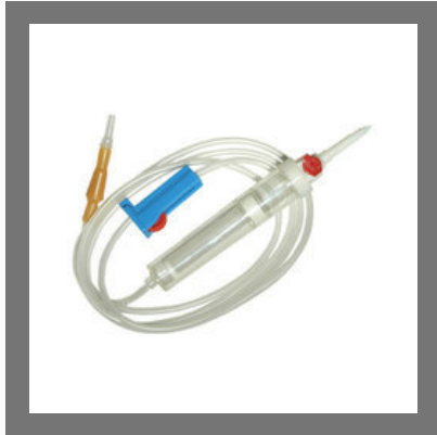
Medical Blood Transfusion Set