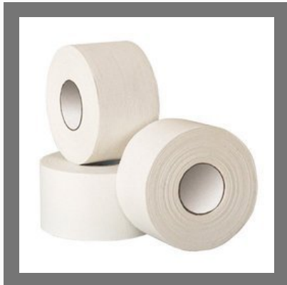
Surgical Paper Tape