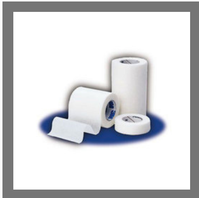
3m Surgical Tape