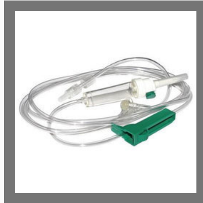
Blood Infusion Set