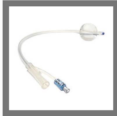
Foley Balloon Catheter