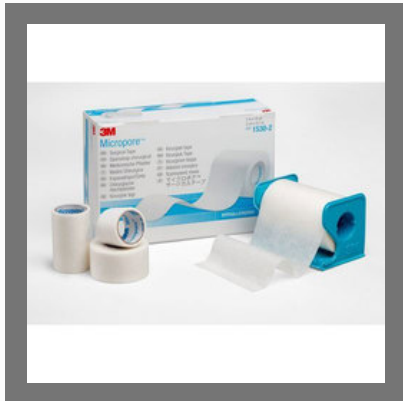
3m Micropore Tape