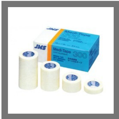
JMS Meditape Surgical Tape