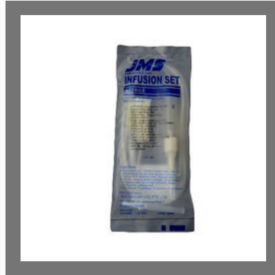
IV Infusion Set