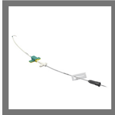
Certifix Mono Catheter