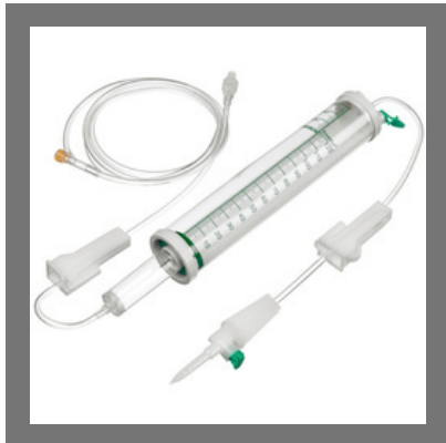
Dosifix Infusion Device