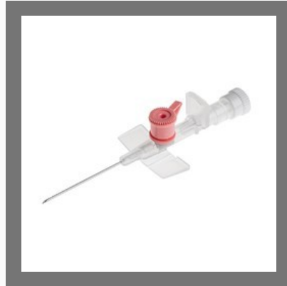
Venflon IV Cannula