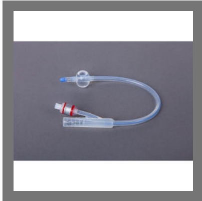
Safecath Silicon Catheter