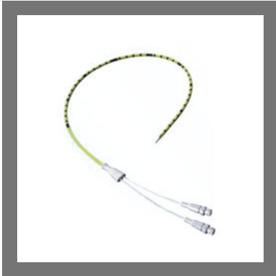
Dual Lumen Ureteral Catheter