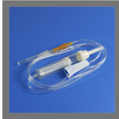
Disposable Sterile Blood Transfusion Set