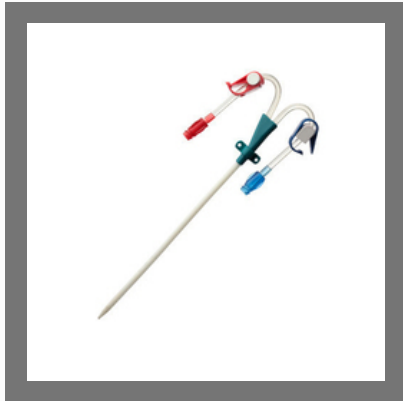
Dialysis Dual Lumen Catheter