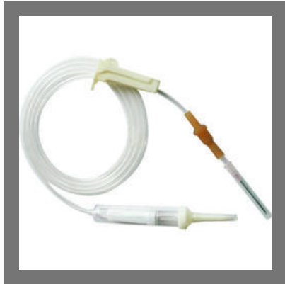
Hospital Blood Transfusion Set