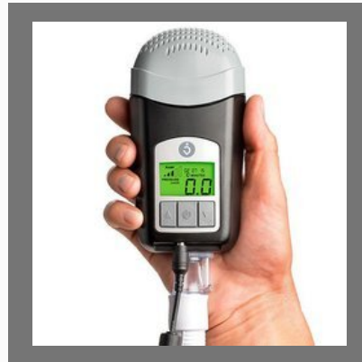
Z1 Auto CPAP