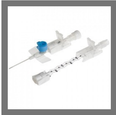
Safety IV Cannula