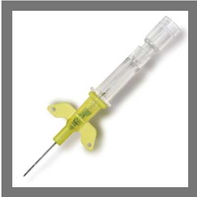
Introcan Safety IV Catheter