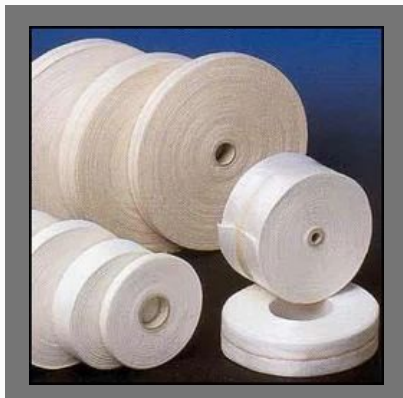
Insulation Cotton Tape