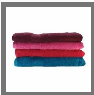
Plain Bath Towel