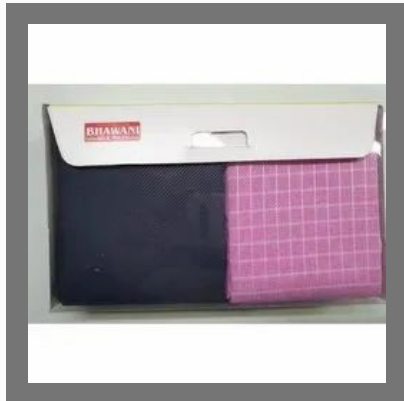
Check Shirt Pant Fabric