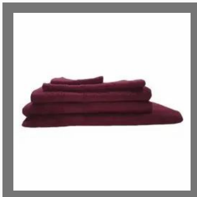
Fancy Bath Towel