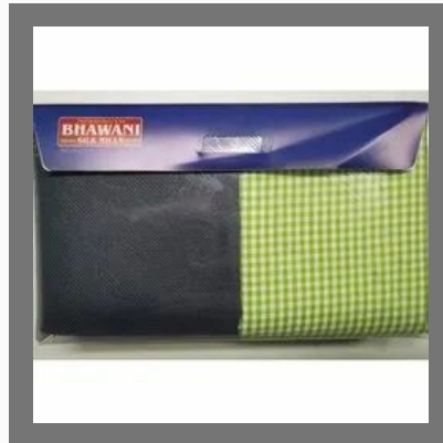
Fancy Check Shirt Pant Fabric