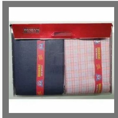
Stylish Check Shirt Pant Fabric