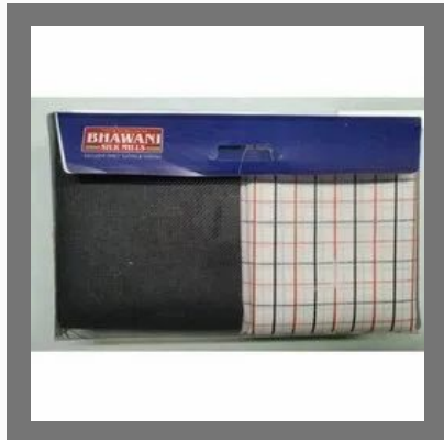
Designer Check Shirt Pant Fabric