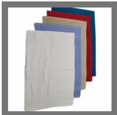
Cotton Small Hand Towel