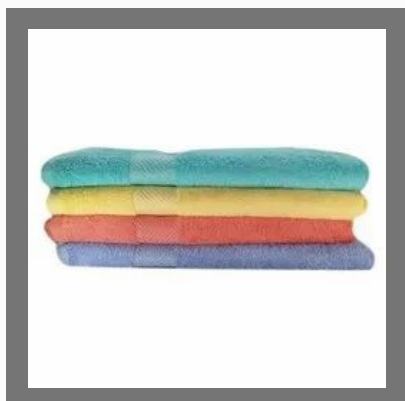
Plain Fancy Bath Towel