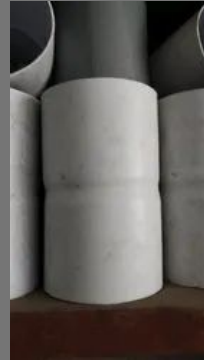
3 Inch Socket