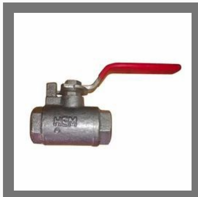
Cast Iron Ball Valve 20mm