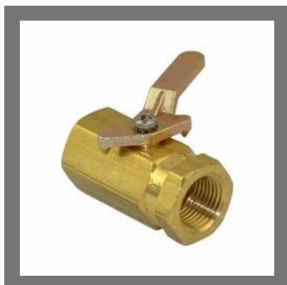
Cast Iron Handle Ball Valve