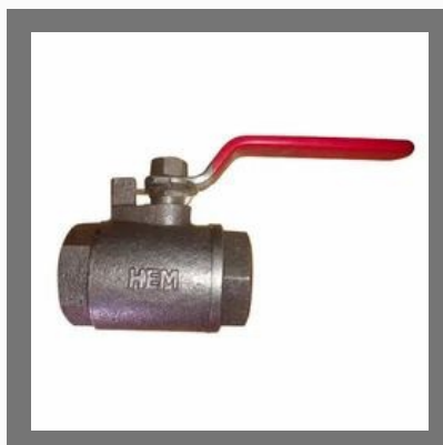
Cast Iron Ball Valve 40mm