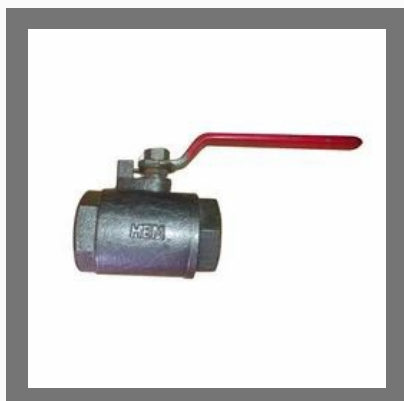
Cast Iron Ball Valve 25mm