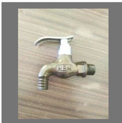
Cast Iron Bib Cock 15mm