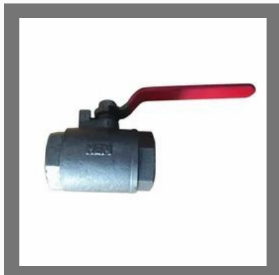
Cast Iron Ball Valve 32mm