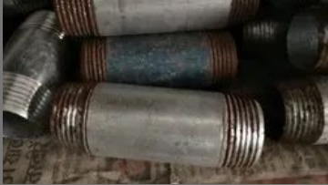
4 Inch Nipple