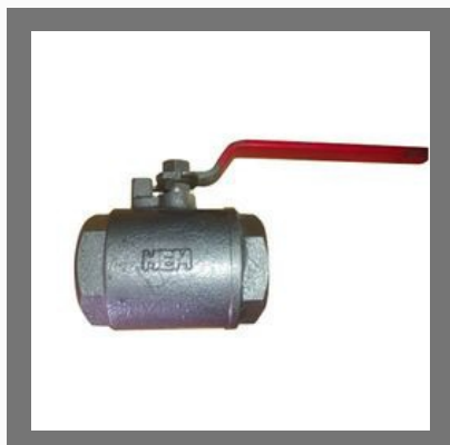
Cast Iron Ball Valve 50mm