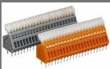
PCB Terminal Block