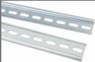
DIN Rail & Accessories