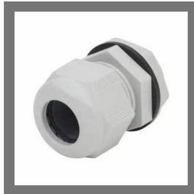
PG Cable Gland