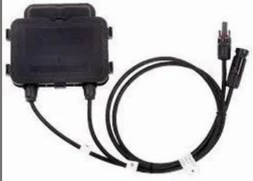
PV Junction Box