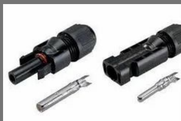
EMPV4 - MC4 Connector