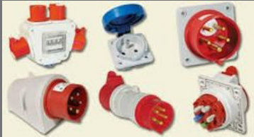
Plugs and Sockets