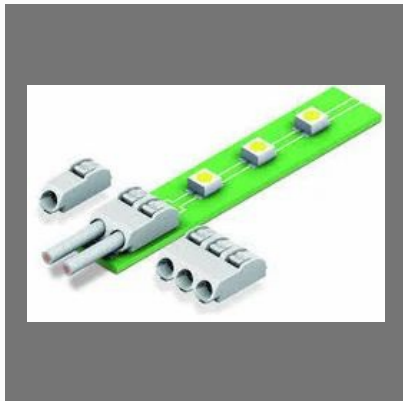
SMD Connector- Lighting Connector