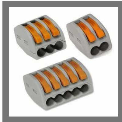
Lighting Connectors - Installation Connectors