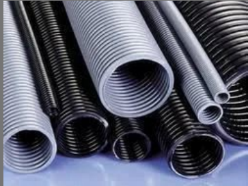
Conduits - Normal, Slit, Metal, Flexible