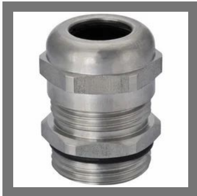
MS & PG Cable Gland