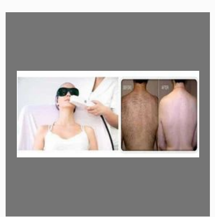
Laser Hair Removal Treatment Services