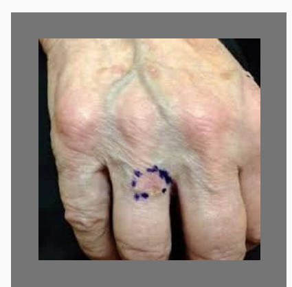
Skin Biopsy Treatment Services