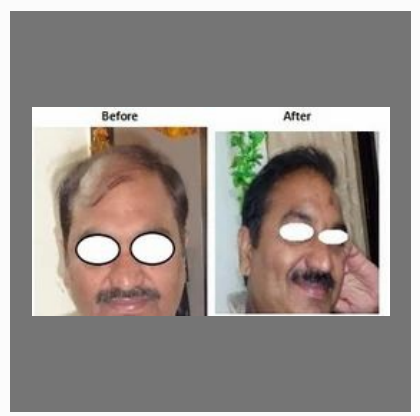
Hair Transplant Treatment Services