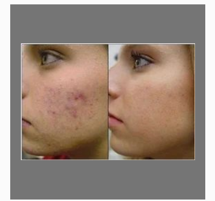
Chickenpox Scar Surgery Treatment Services