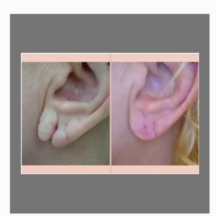
Stitchless Ear Lobe Repair & Ear Piercing free