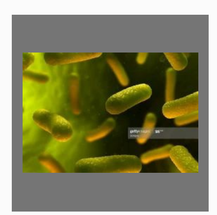
Bacillus Licheniformis 200 Bs/g