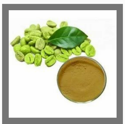
Green Coffee Bean Extract 50%