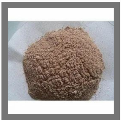
Bacillus Subtilis 100 Billion Cells/G