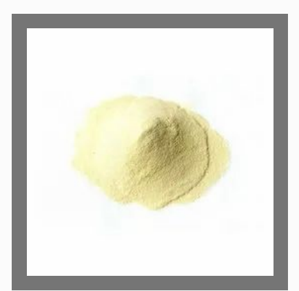
Saccharomyces boulardii 20bc/g