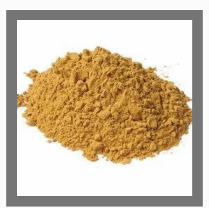
Ashwagandha Extract .