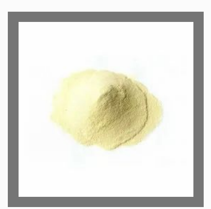
Zinc Yeast 10%