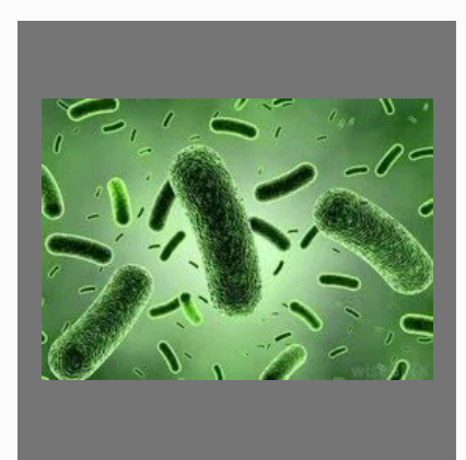
Bacillus Coagulans 200 Billion Spores/g