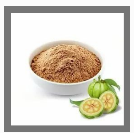
Garcinia Cambogia Extract 50 %