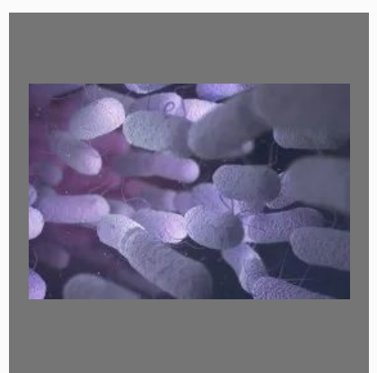
Bacillus subtilis .