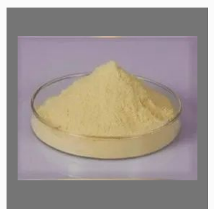
Iron Enriched Yeast 5%