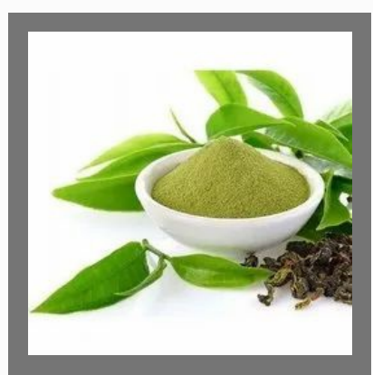
Green Tea Extract