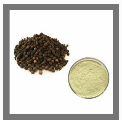
Piperine 95% powder