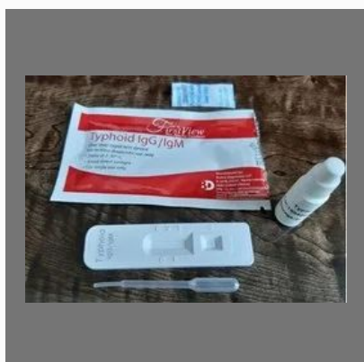
Dengue Ns1 Antigen Test Kit