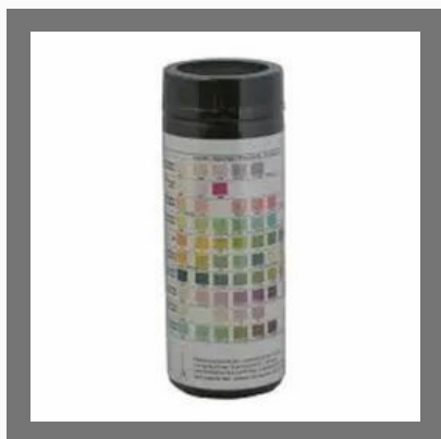
Urine Strip (11 Parameter) Multipara