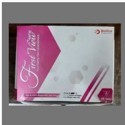
Hba1C test kit and reagents