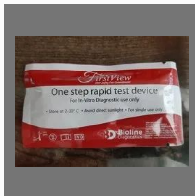
Vitamin D Rapid Test Kit/