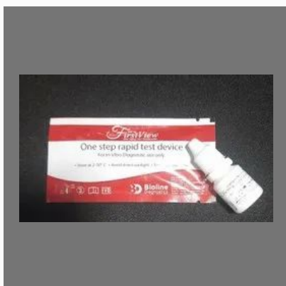
Hbsaa Rapid Test