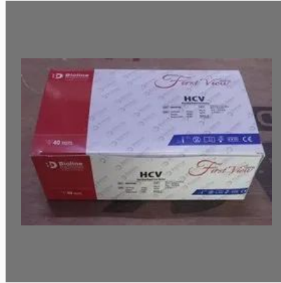
Hcv Rapid Test Kit