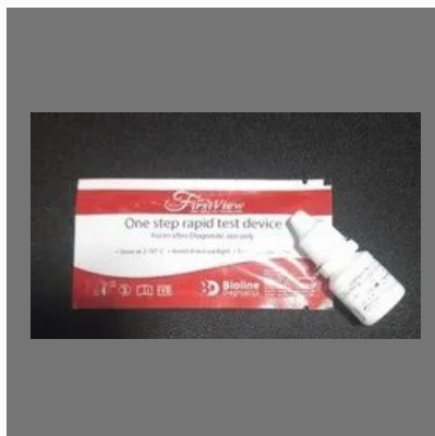
Dengue Combo Kit