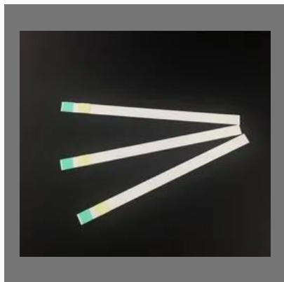
Urine Strip Glucose & Protein 2P