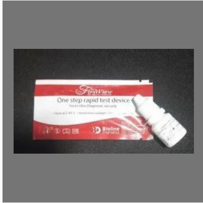
Syphilis Rapid Test Kit