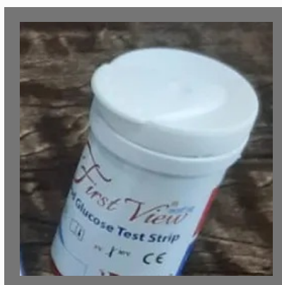
Hb Meter Test Strips