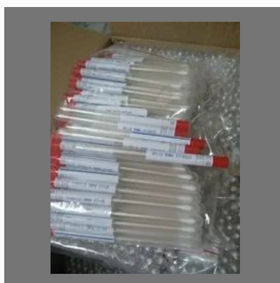
Cotton Swab Stick