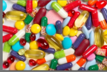
Medicinal Developments Consultancy Service