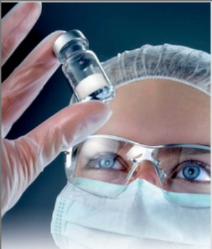
Formulation Development Consultancy Service