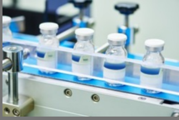
Pharmaceutical Regulatory Affairs Consulting