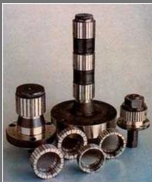
Expanding Mandrel & Sleeves