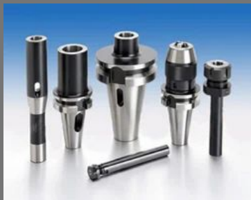
Drill Chuck & MT Holders