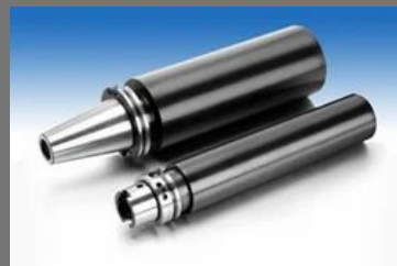
Boring Bar Blanks