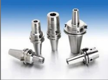
Shrink Fit Holders