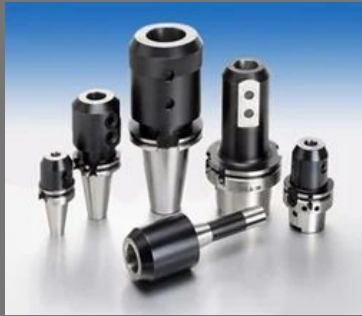
End Mill Holders