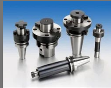
Shell Mill Holders