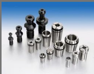
Collets & Pull Studs