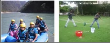
Outbound Workshops Activity Services