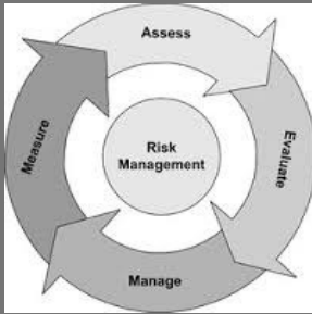
Management Assurance Service