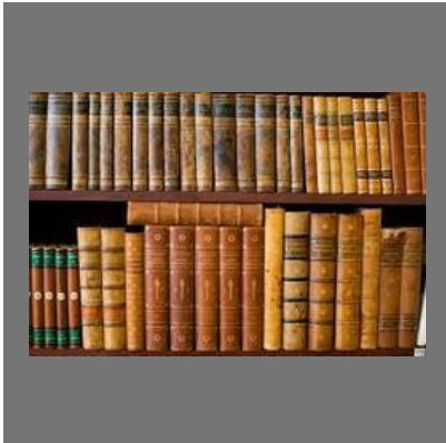
Tax Litigation Service