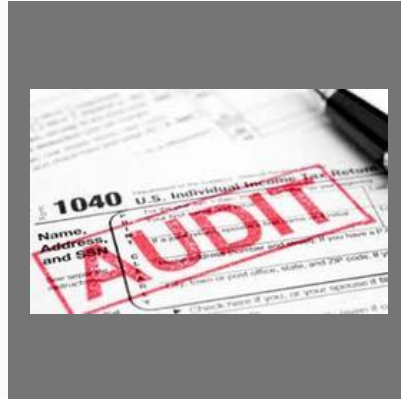
Tax Audits Service