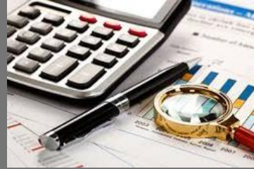
Forecasts Preparation Service