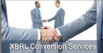
XBRL Conversion Services