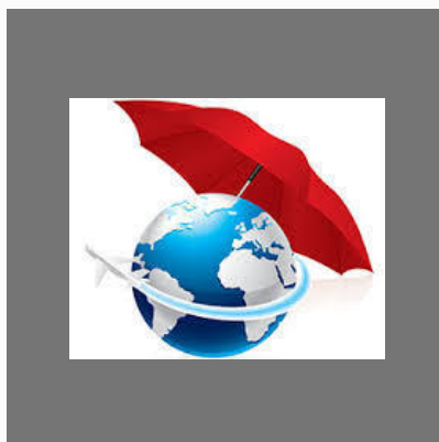
Statutory Audit Assurances Service