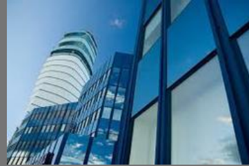
Company Incorporation Service