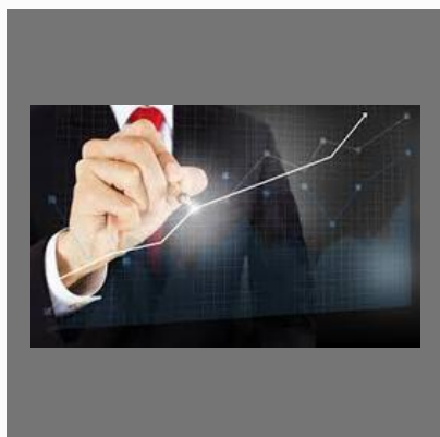
Business Valuation Service