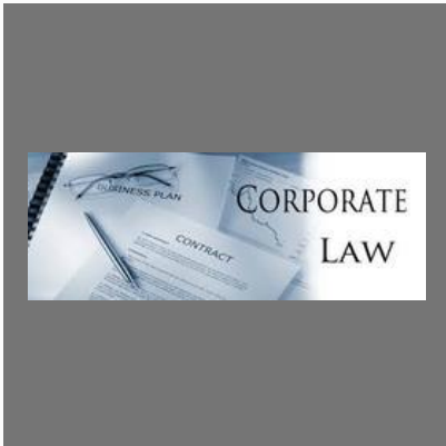
Corporate Law Service