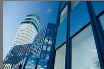
Annual Filings Service