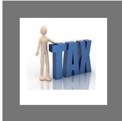
Search & Seizure Advisory Service