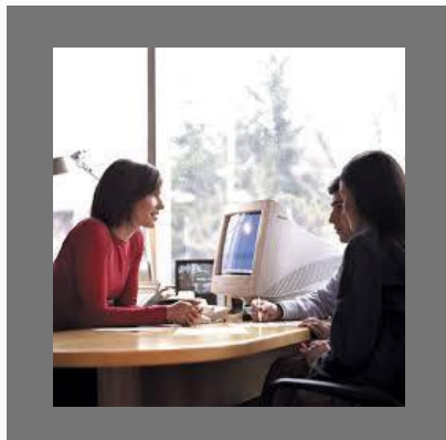
Personal Taxes Service