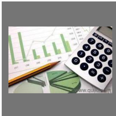
ROC Forms Filing Service