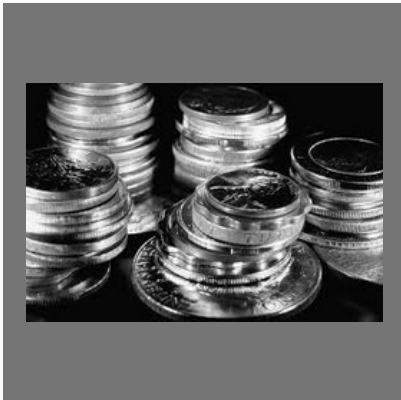
Foreign Exchange Law Service