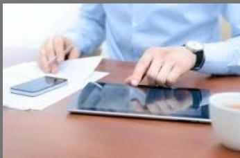
Secretarial Compliance Service