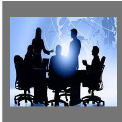
Financial Advisory Service