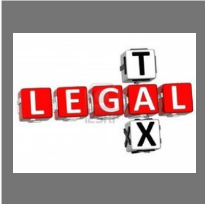
Corporate Taxation Advisory Service