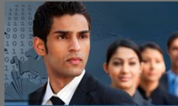
Business Insurance Plans