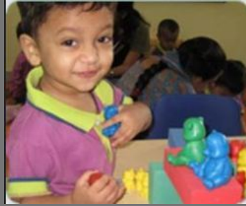
Child Protection Plans