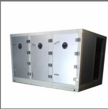
Mild Steel Double Skin Air Handling Unit