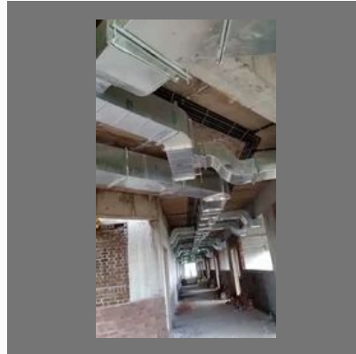
Mild Steel AC Duct