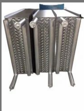
Stainless Steel Cooling Coil