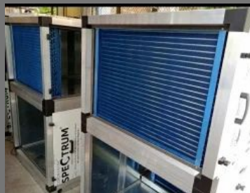
Stainless Steel HVAC System