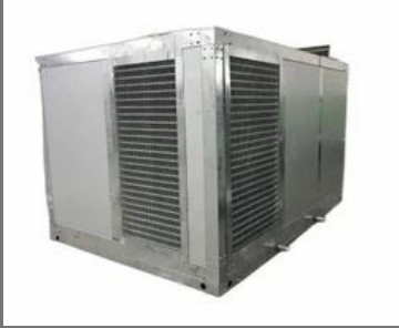
Single Skin Air Handling Unit (AHU)