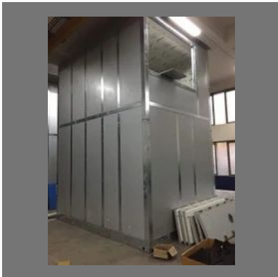
Stainless Steel Evaporative Cooling System