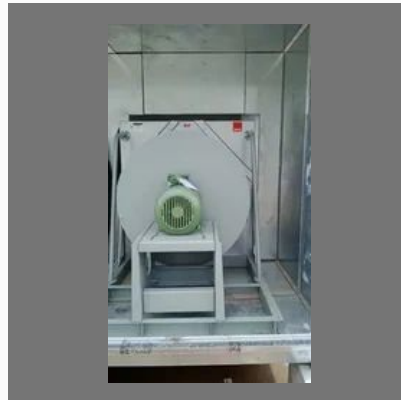
Duct AC Fan Motor