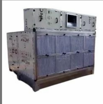
Aluminium Double Skin Air Handling Unit