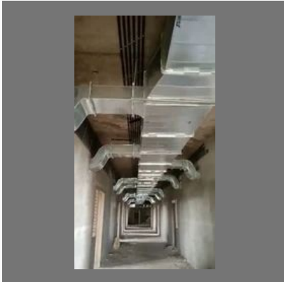
Industrial AC Duct