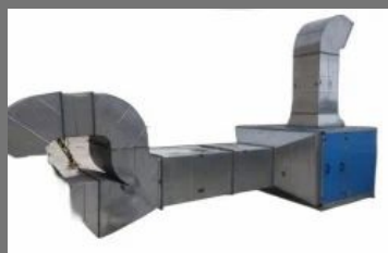
Stainless Steel Air Exhaust Duct