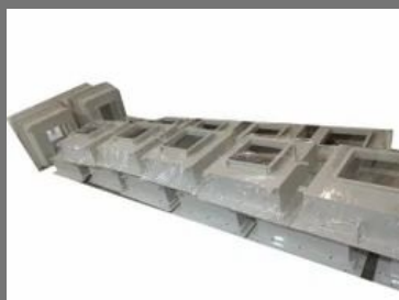
HEPA Filter Housing Box