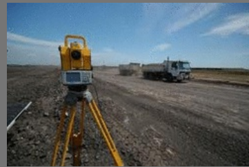
Boundary & Contour Surveys