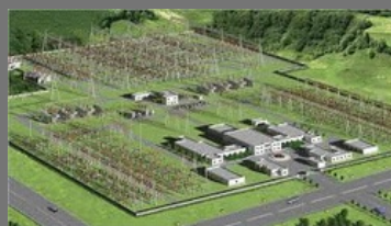
Power Grid Surveys