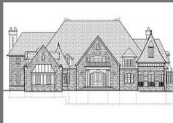
Auto CAD Drafting