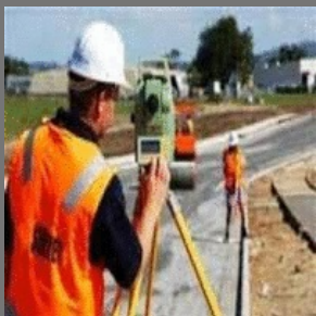
Roads & Railways Alignment Surveys