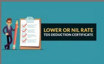
TDS Lower Deduction Certificate Service