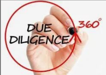
Due Diligence Service