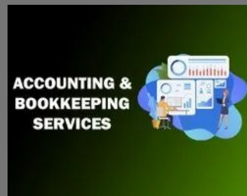
Accounting And Bookkeeping Service