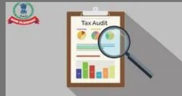
Tax Audit Service