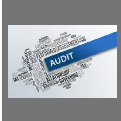
Account Auditing Services