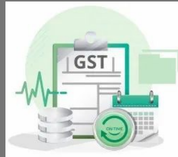
GST Returns Service