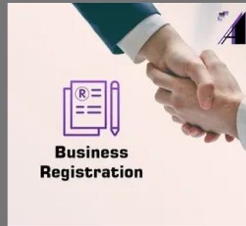
Company LLP Incorporation Services