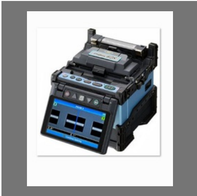
62S Fujikura Splicer