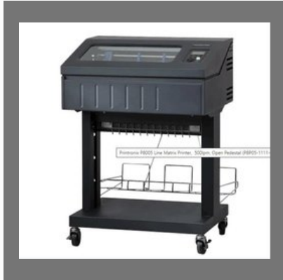
Printronix P8005 Line Matrix Printer