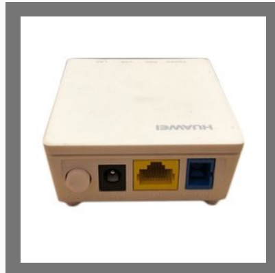
HG8310M Gpon 1G Network Router