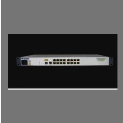
MDF Huawei 24 Port