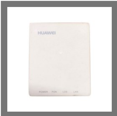
Huawei Network Router