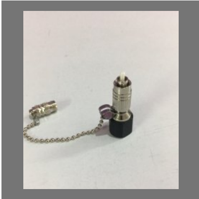
Bare Fiber Adapter