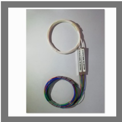
2X4 PLC Splitter