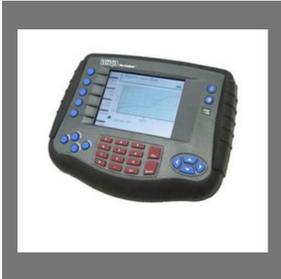
Site Master Testing Equipment