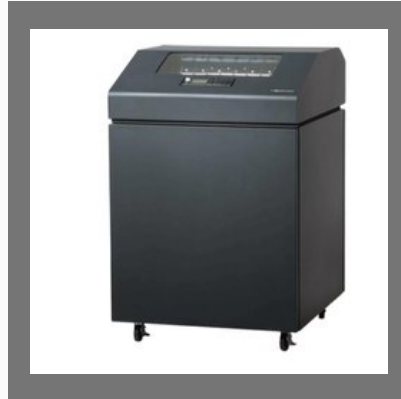
P8210 Printronix Line Matrix Printer