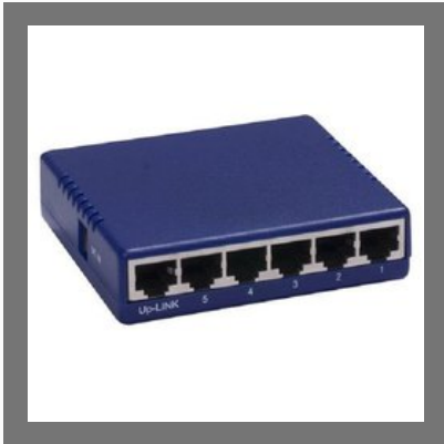
Switch OP-MEN 99328 20-Port