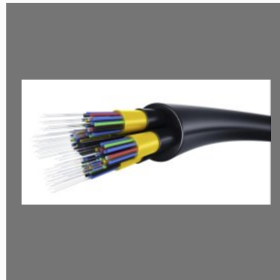
Fiber Optic Cable