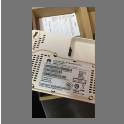
Epon Onu gpon xpon