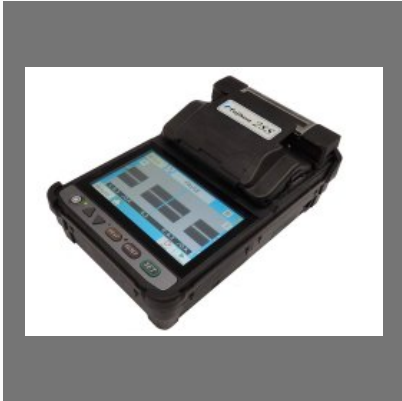
Fujikura 28S Fiber Optic Splicing Machine