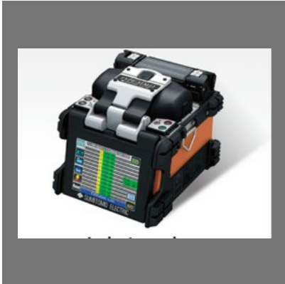
81M12 Sumitomo Splicing Machine