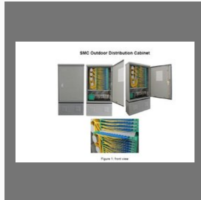
288 Fibers SMC Outdoor Distribution Cabinet