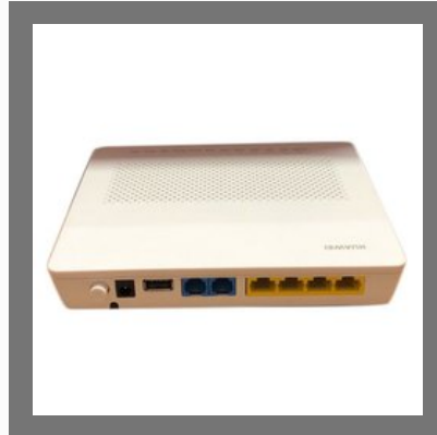
HG8346R Network Router