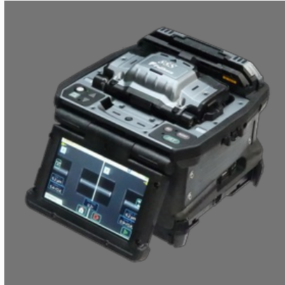
Fujikura 88S Splicing Machine