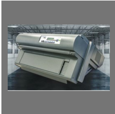
Printronix S809 Serial Matrix Printer