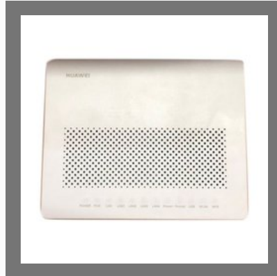
EPON Terminal Network Router