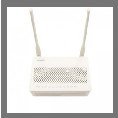
Huawei EG8141A5 Router