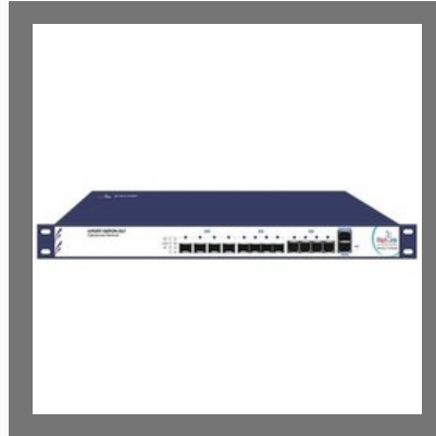
Optilink OP-Eolt 97024P 4 Port