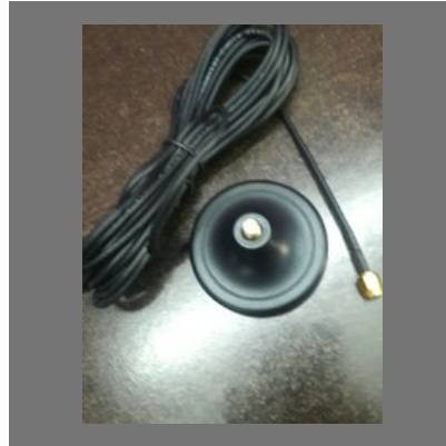
10DBI GSM Antenna