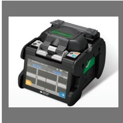
Z2C Sumitomo Splicing Machine