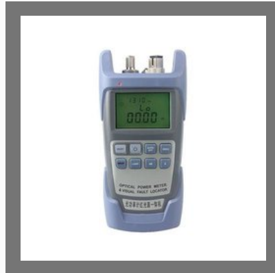
DXP-50D-10MW Optical Power Meter