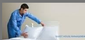
Accommodation Management Services