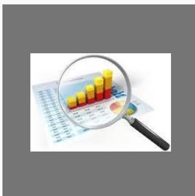
Accounting & Financial Analysis Services