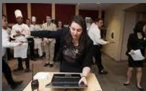
Hotel Administration Management Service