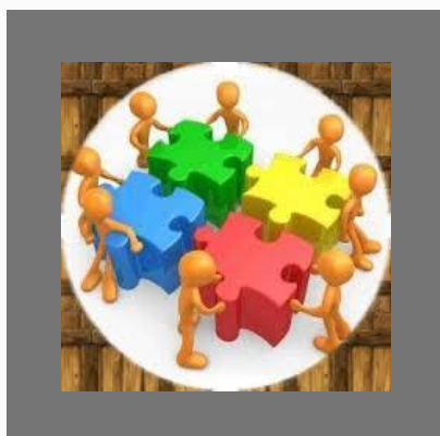
Production & Operation Management Services