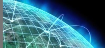
Computer Fundamental Services