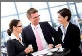
Operations Research Services