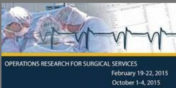
Operations Research Services