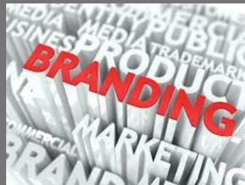
Consumer Behavior & Advertising Management Services