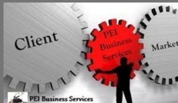
Production & Operation Management Services