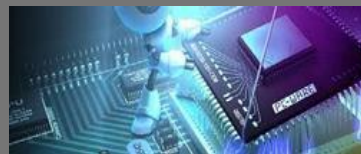
Computer Fundamental Services