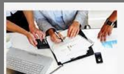
Accounting & Financial Analysis Services