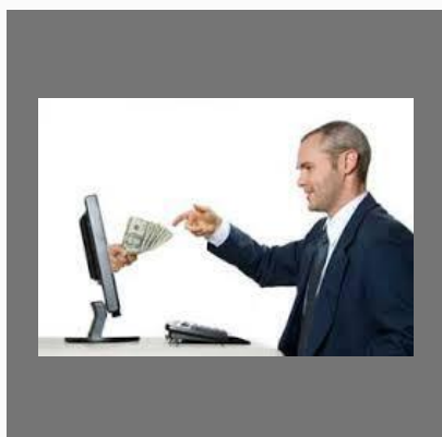
Financial Management Services