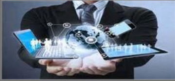
Marketing Management Services