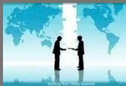
Sales & Distribution Management Services